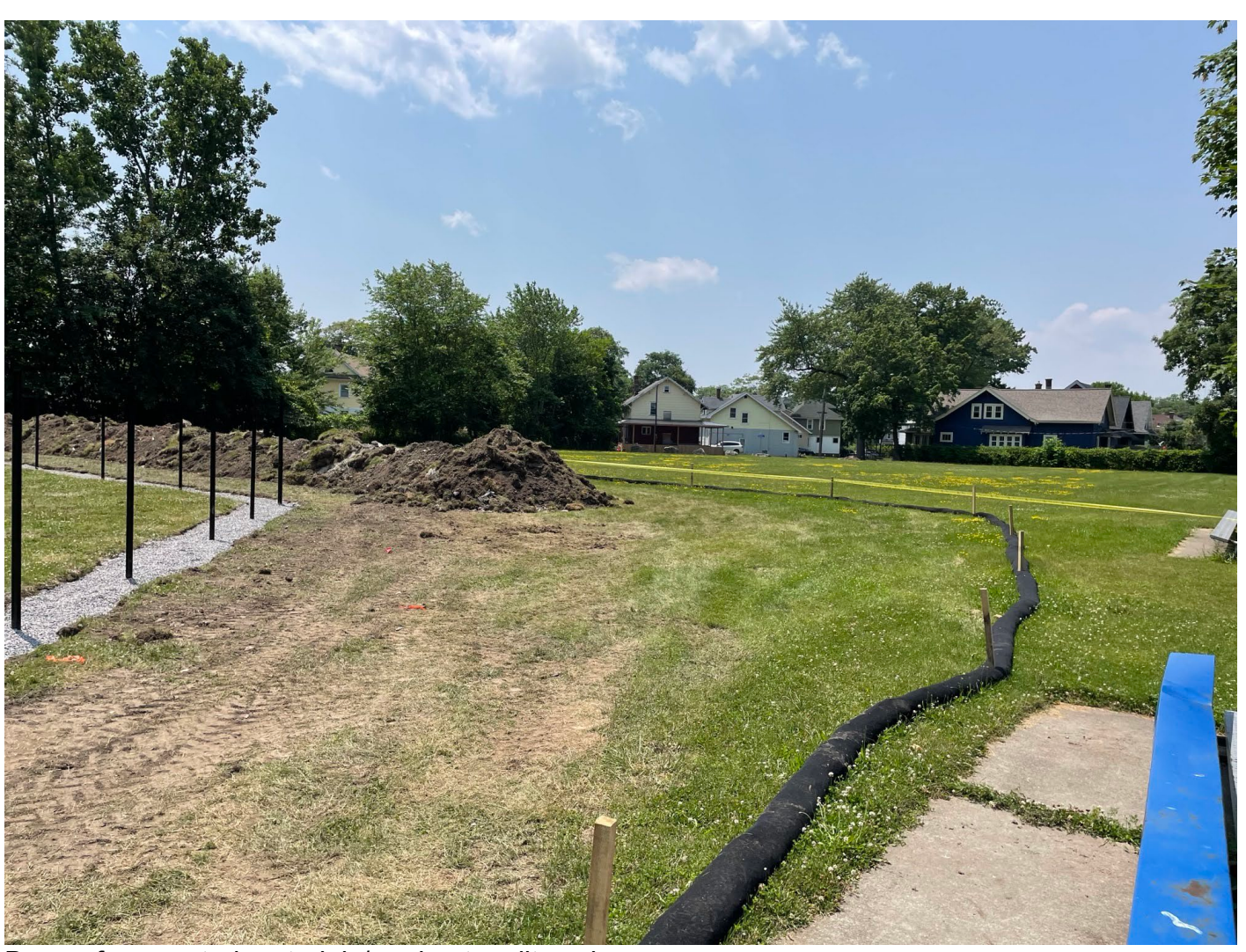
Berm of excavated materials/ perimeter silt sock.