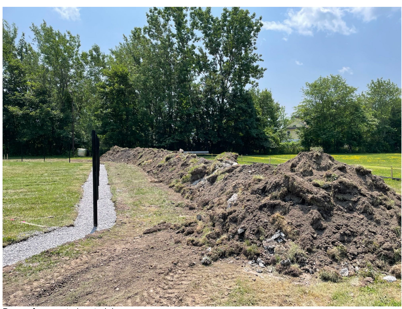
Berm of excavated materials.