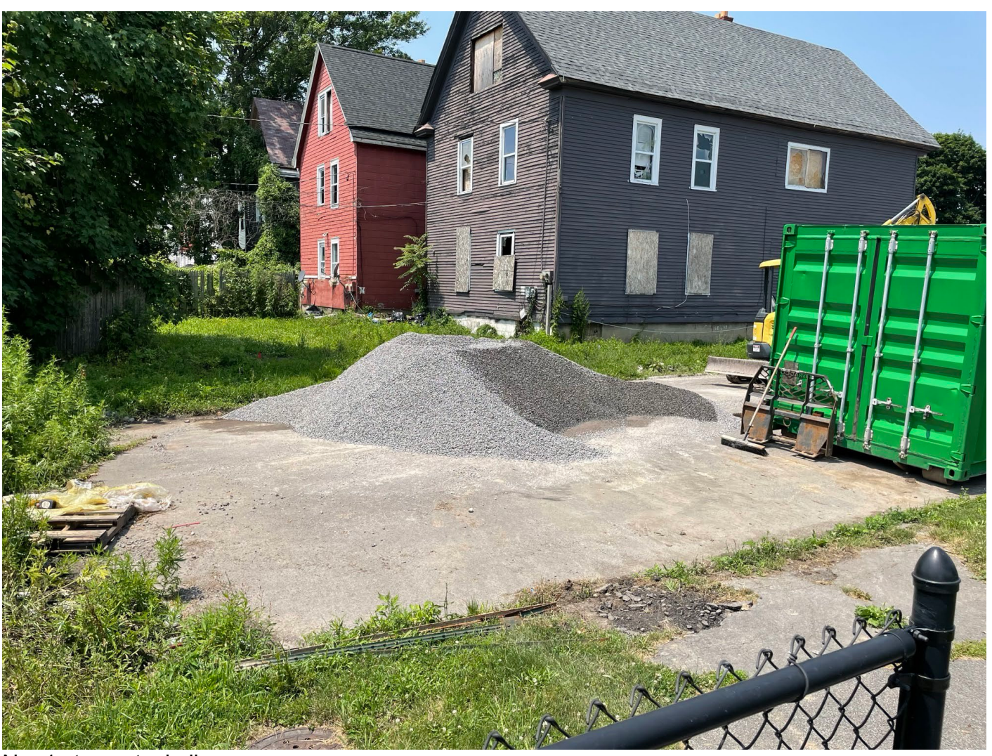
No. 1 stone stockpile.