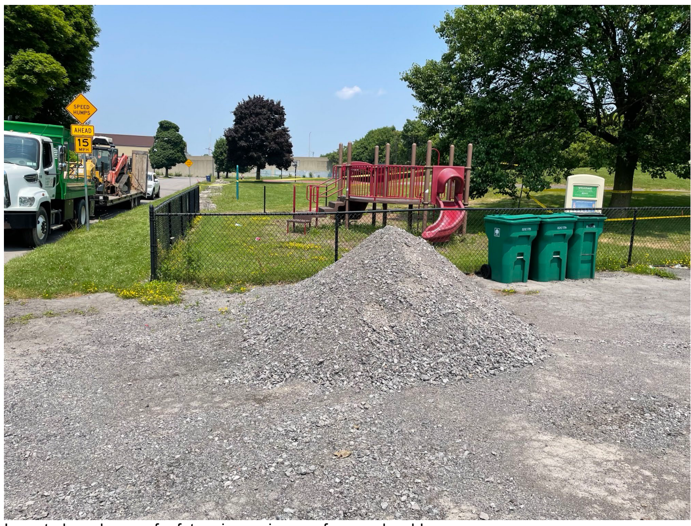
Imported crusher run for future impervious surface work subbase.