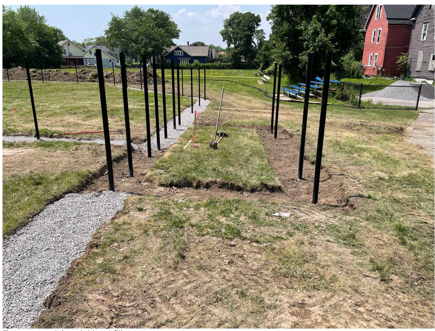
Fence trench/partial backfill.