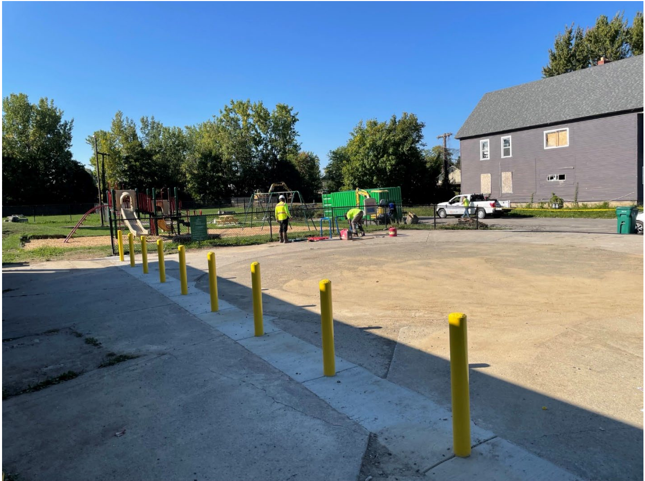
Bollard installation/site conditions.