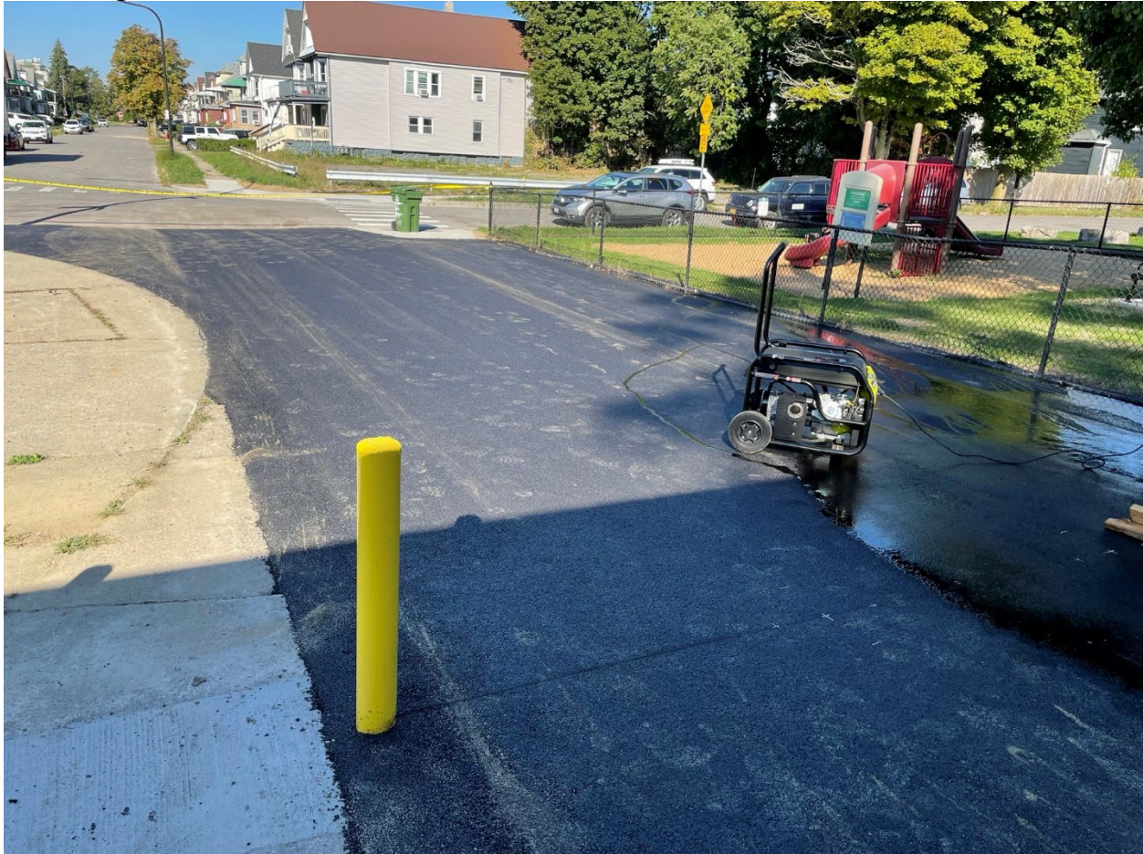
Completed asphalt area.