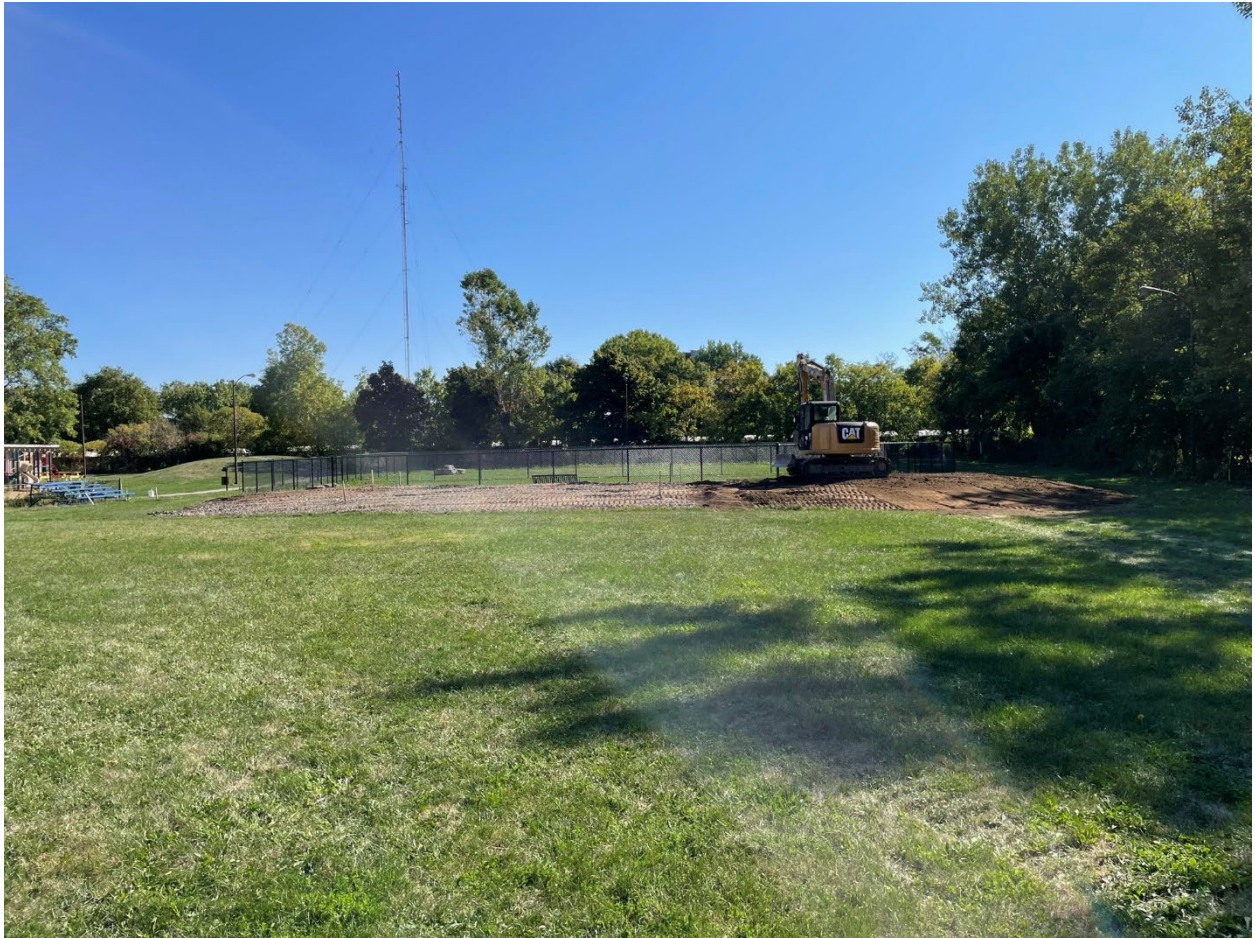
Spoils berm partially covered with imported clean topsoil cover, pending seeding.