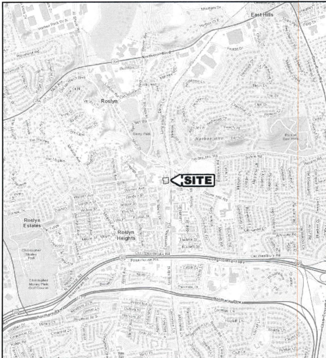
EXHIBIT A SITE MAP

V:\GIS\Projects\3110\00011\05\3110.00011\05.1.mxd