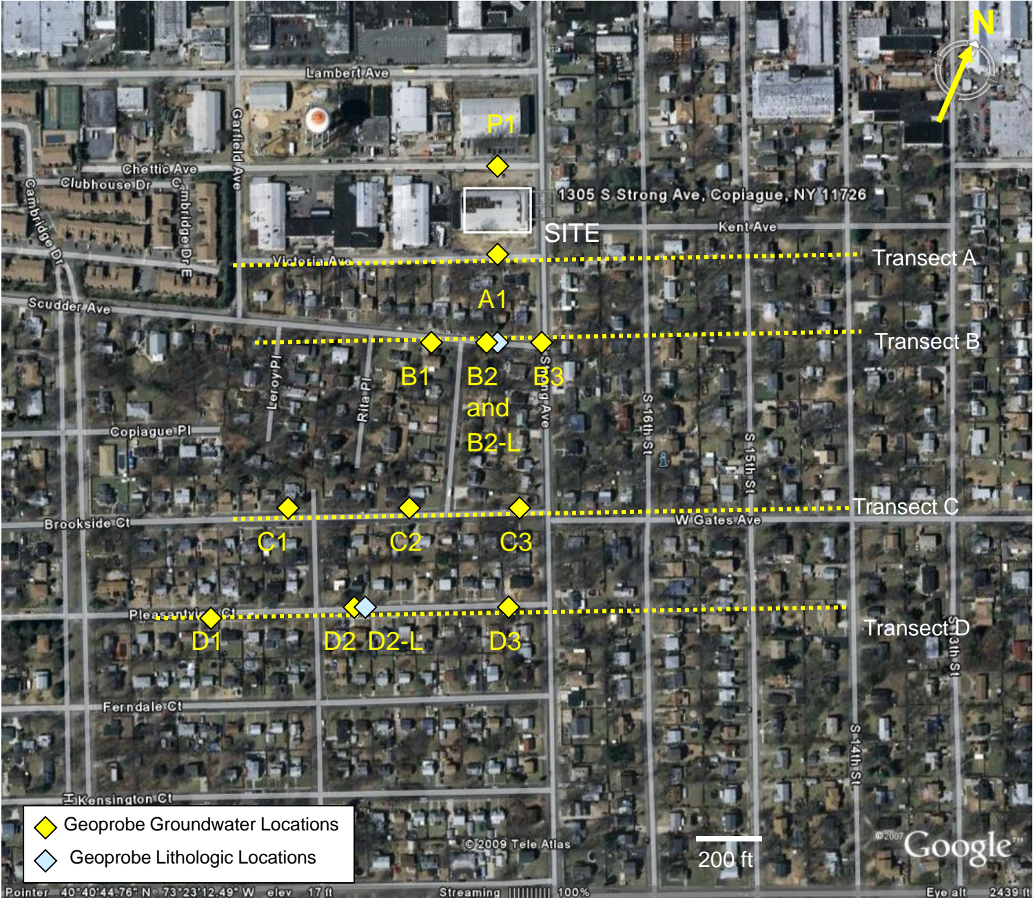
Figure 2: Off-Site Levey Property Groundwater Investigation