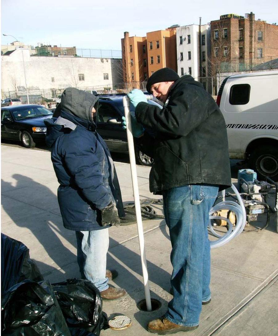
1. Insertion of pipe into well.