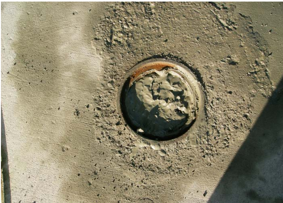
3. Well cap filled with concrete.