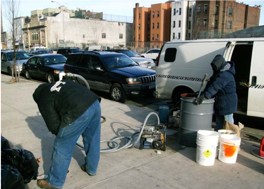
2. Pump utilized to pump grout into well.