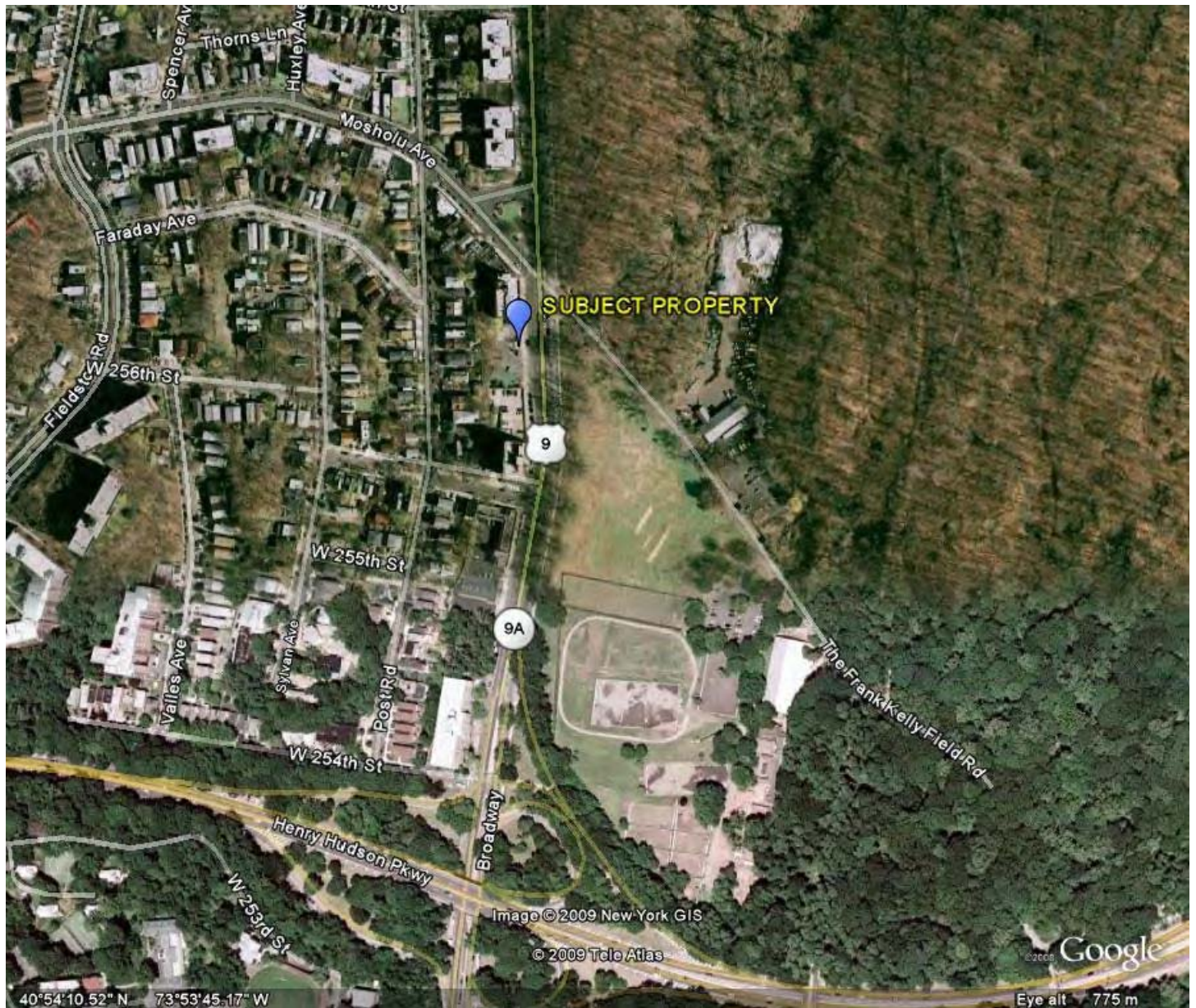
Figure 1 - Site Location Map