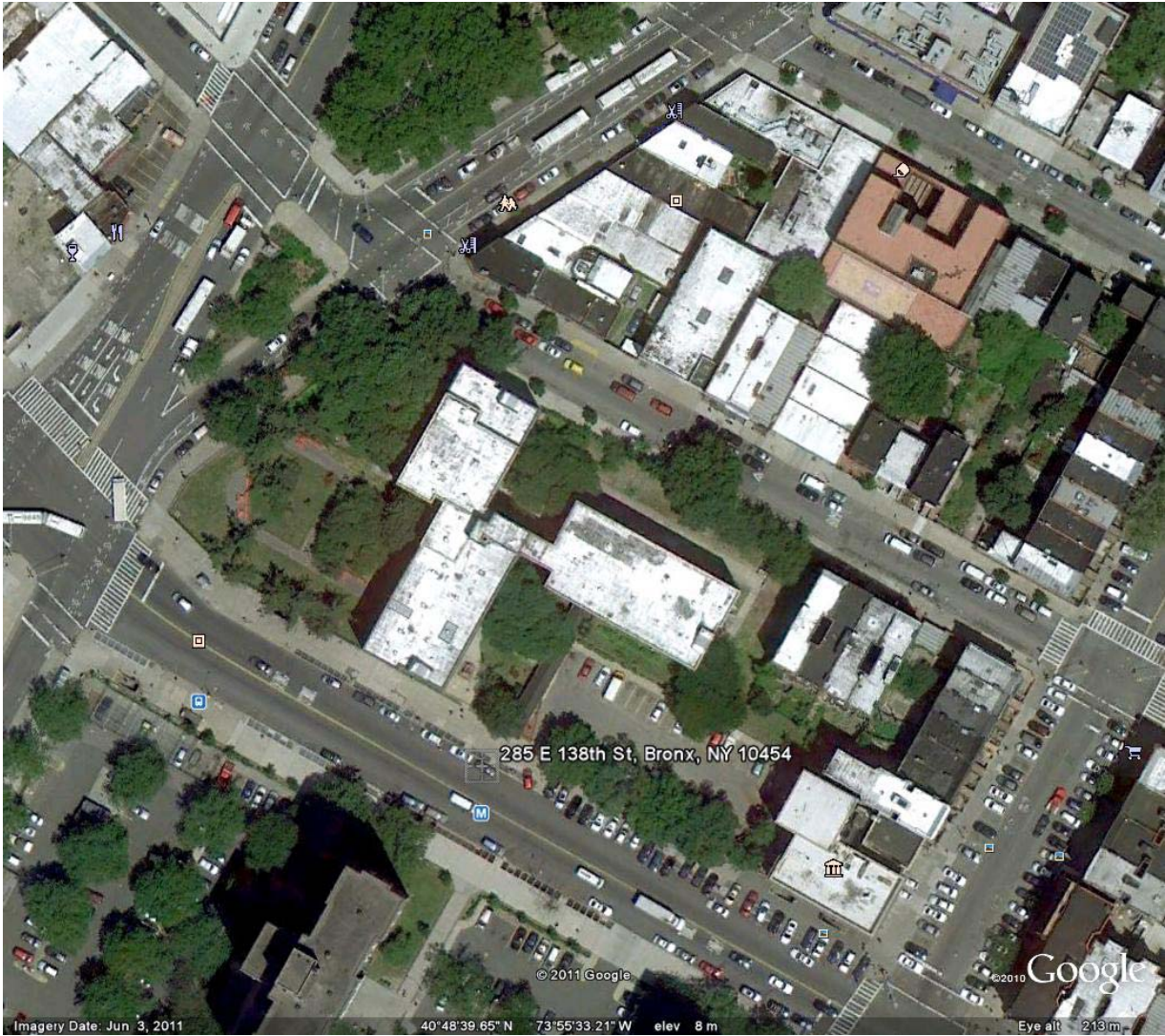
Figure 1 - Site Location Map