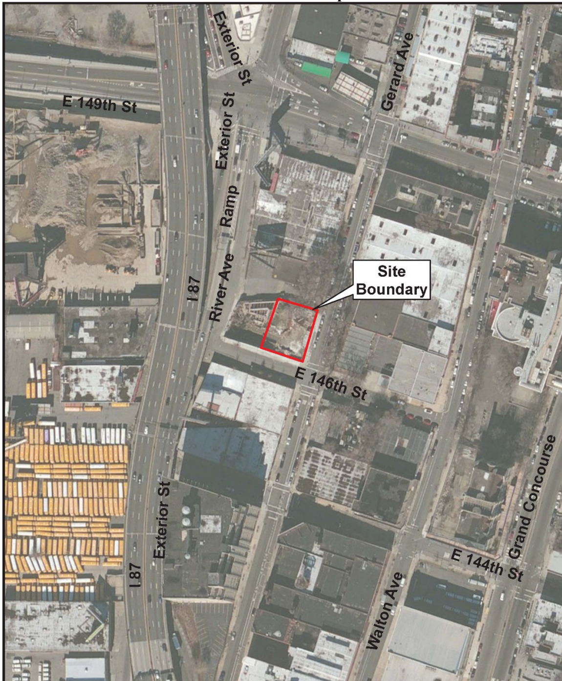
Site Location Map