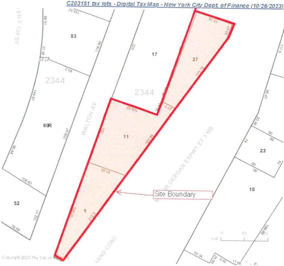
C203151 - Site Boundary