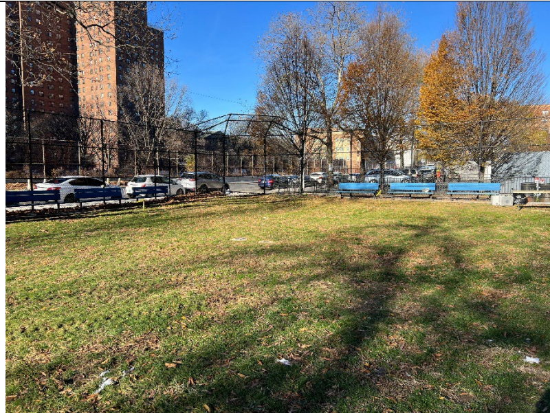
Photo 1: Looking north, view of marked out soil boring locations RISB-12, RISB-14 and monitoring well RIMW-5.