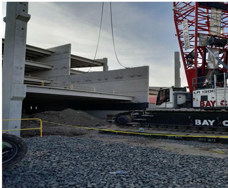
Photo 2: Facing South; additional prefabricated concrete form being added to structure on the 21 st Street side of the site.

Submitted By: Brandan Lawrence of Roux Environmental Engineering and Geology, D.P.C.