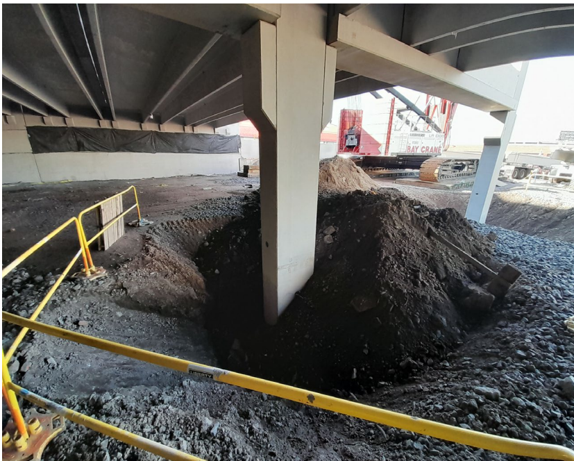
Photo 4: Facing West; soil that was previously excavated to unearth a previously installed pile cap was used to backfill in the same location after the concrete column was installed and reinforced.

Submitted By: Brandan Lawrence of Roux Environmental Engineering and Geology, D.P.C.