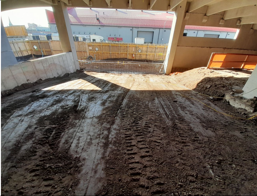
Photo 3: Facing Southwest; graded soil in area B3 in the future loading dock area.