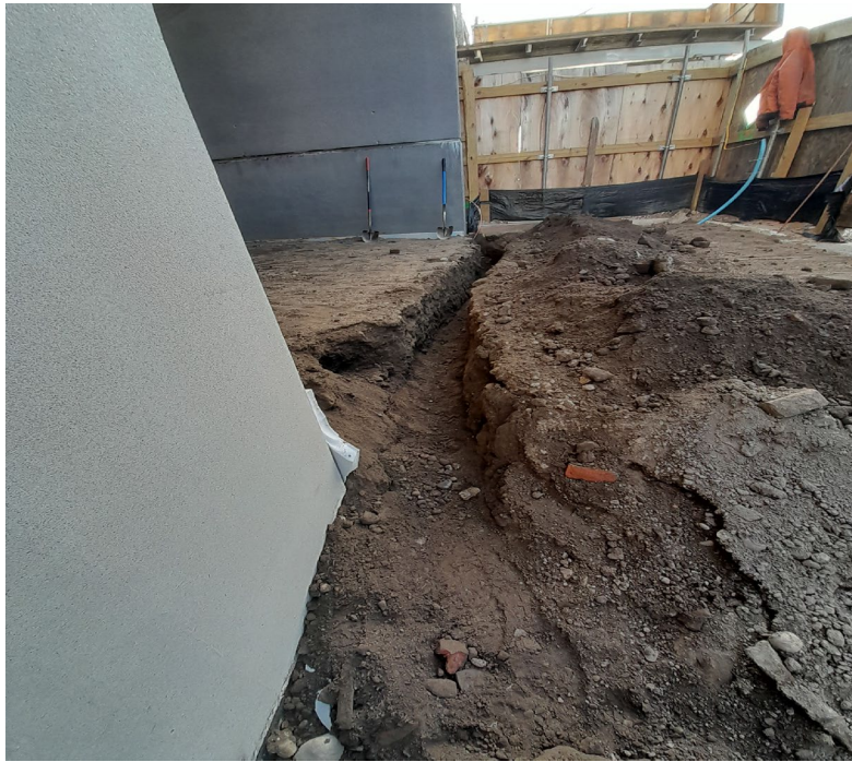
Photo 1: Facing Southeast; hand dug trench prepared for installation of lightning grounding protection.