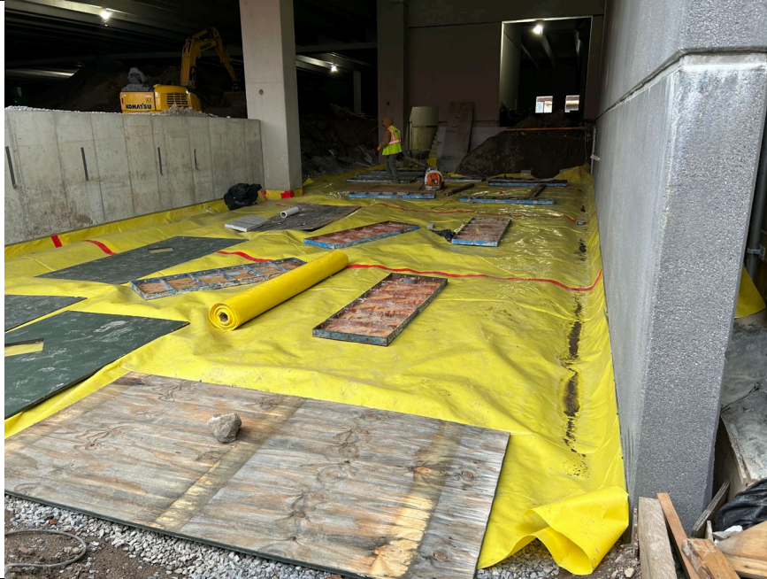
Photo 3: Progress of vapor barrier installation along south side of grid B3.