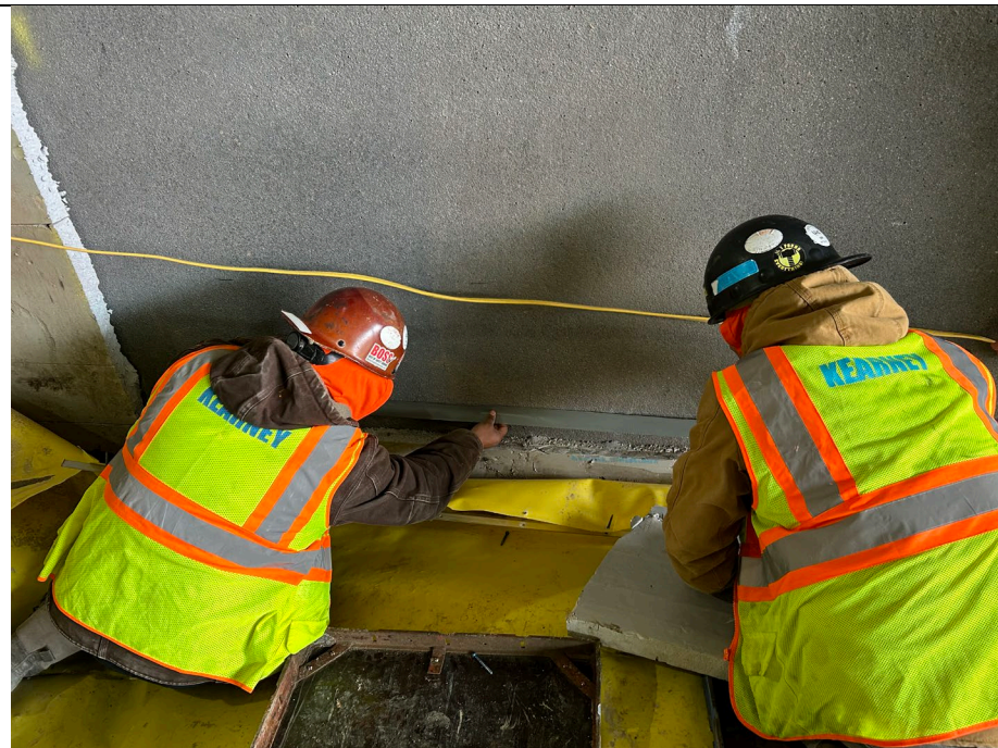
Photo 2: Detail of vertical vapor barrier installation against precast wall; applying double-sided tape prior to securing the vapor barrier to the tape with a termination bar in grid B3.

Submitted By: Sven Carlstrom of Roux Environmental Engineering and Geology, D.P.C.