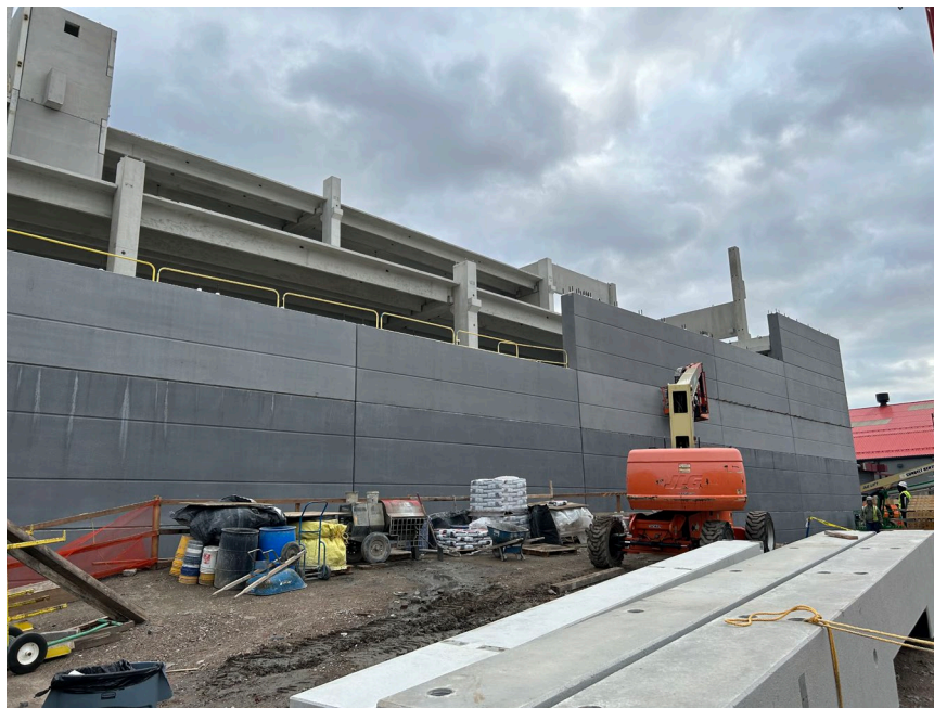
Photo 4: Facing south, progress superstructure at the end of the day.

Submitted By: Sven Carlstrom of Roux Environmental Engineering and Geology, D.P.C.