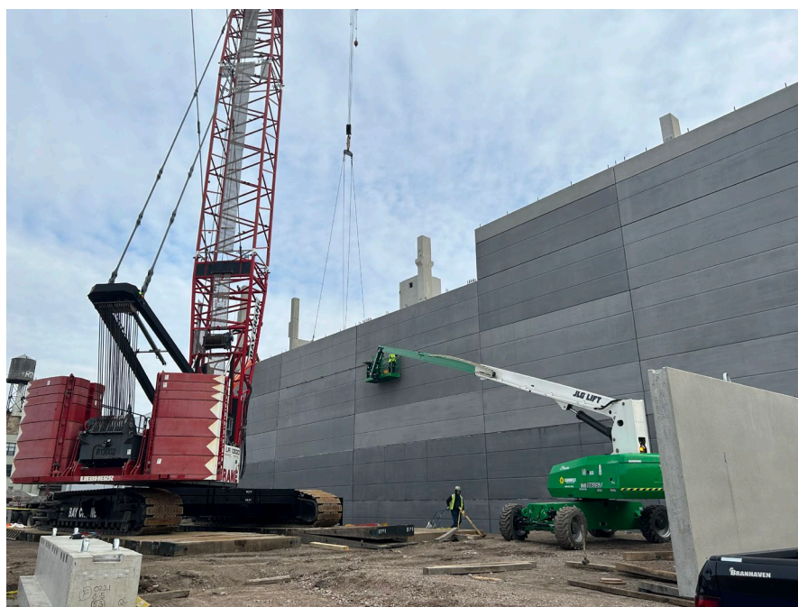
Photo 4: Facing North, progress superstructure at the end of the day.