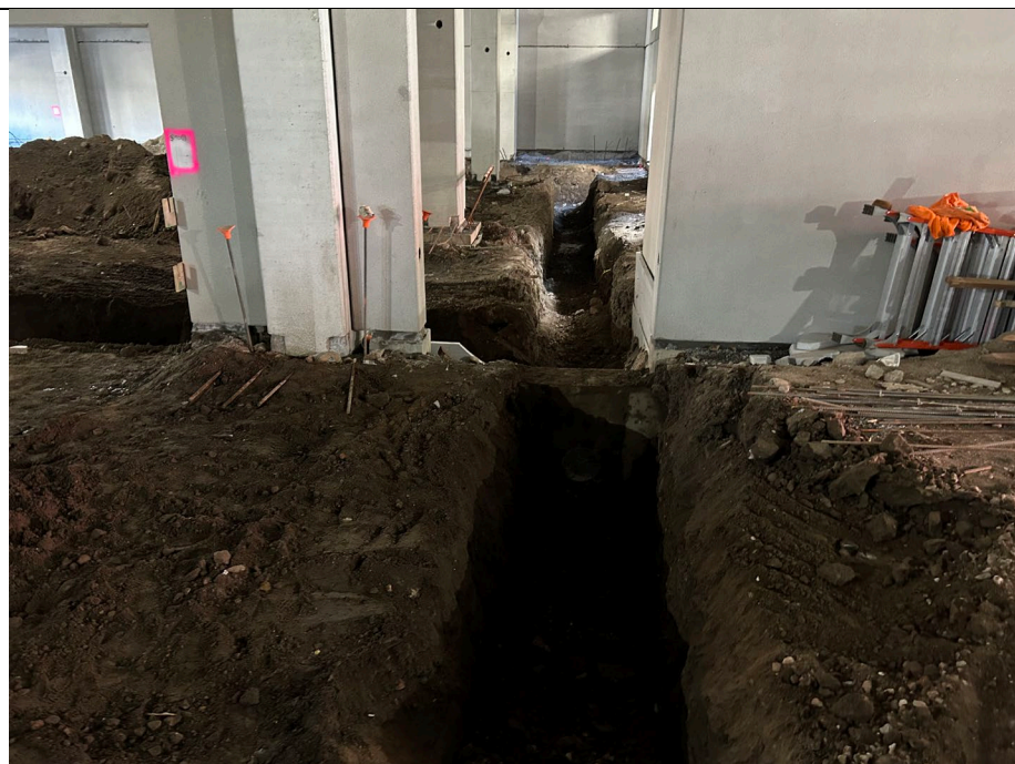
Photo 3: Progress of excavation for utilities installation in grid A3. Kingdom excavated the trenches prior to the plumbing installation.