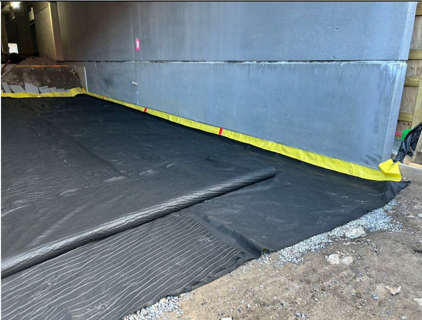
Photo 2: Detail of vertical vapor barrier installation against precast wall; applying double-sided tape prior to securing the vapor barrier to the tape with a termination bar in grid B3. Vapor barrier was covered with a filter fabric for abrasion protection prior to rebar installation.

Submitted By: Sven Carlstrom of Roux Environmental Engineering and Geology, D.P.C.