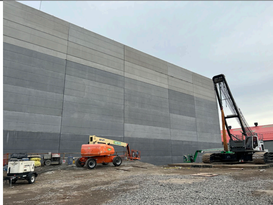
Photo 3: Crane boom completely off site, crawler to be taken apart tomorrow.