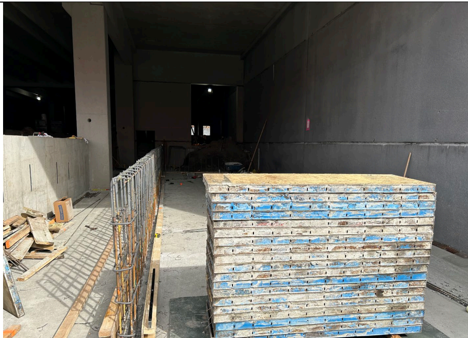
Photo 2: Concrete forms for placement in B3 above previously poured concrete.

Submitted By: Sven Carlstrom of Roux Environmental Engineering and Geology, D.P.C.