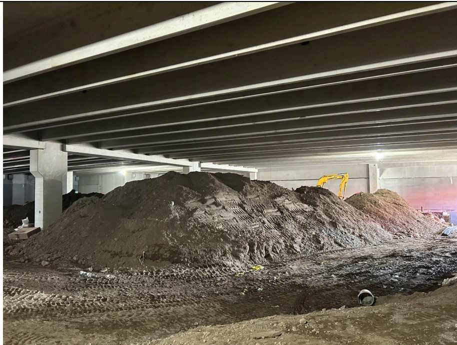
Photo 2: Representative photo of material stockpiled in grids A2 and B2. Soil wasn't moved today.

Submitted By: Sven Carlstrom of Roux Environmental Engineering and Geology, D.P.C.