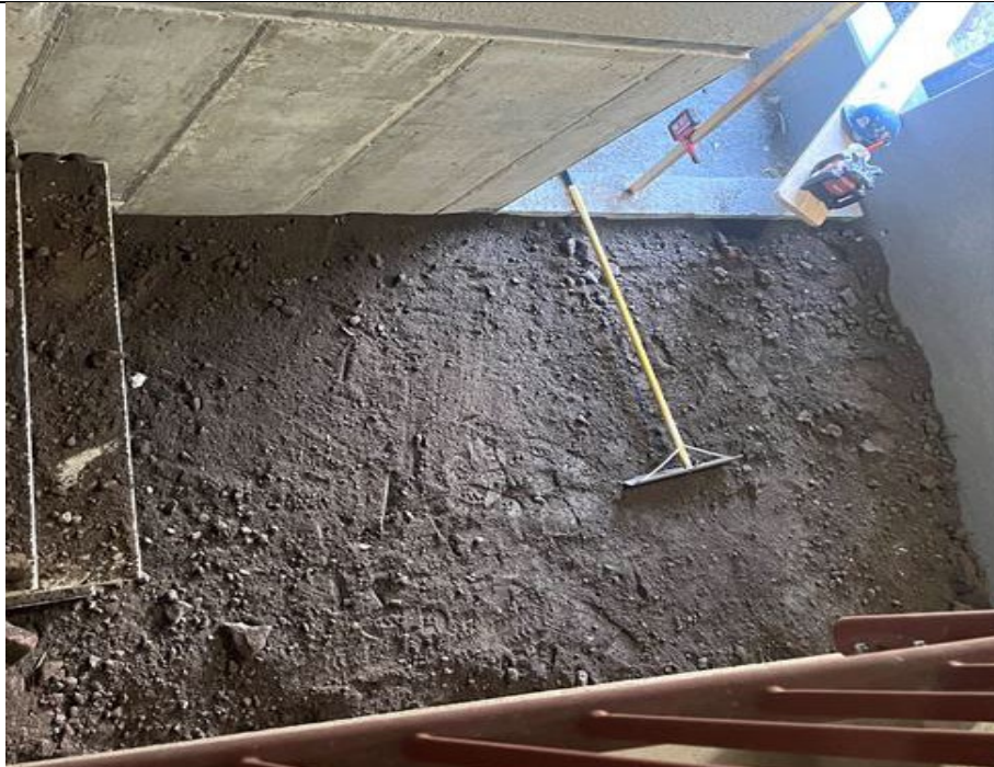
Photo 3: Looking east, kingdom backfills floor in staircase A to raise grade.