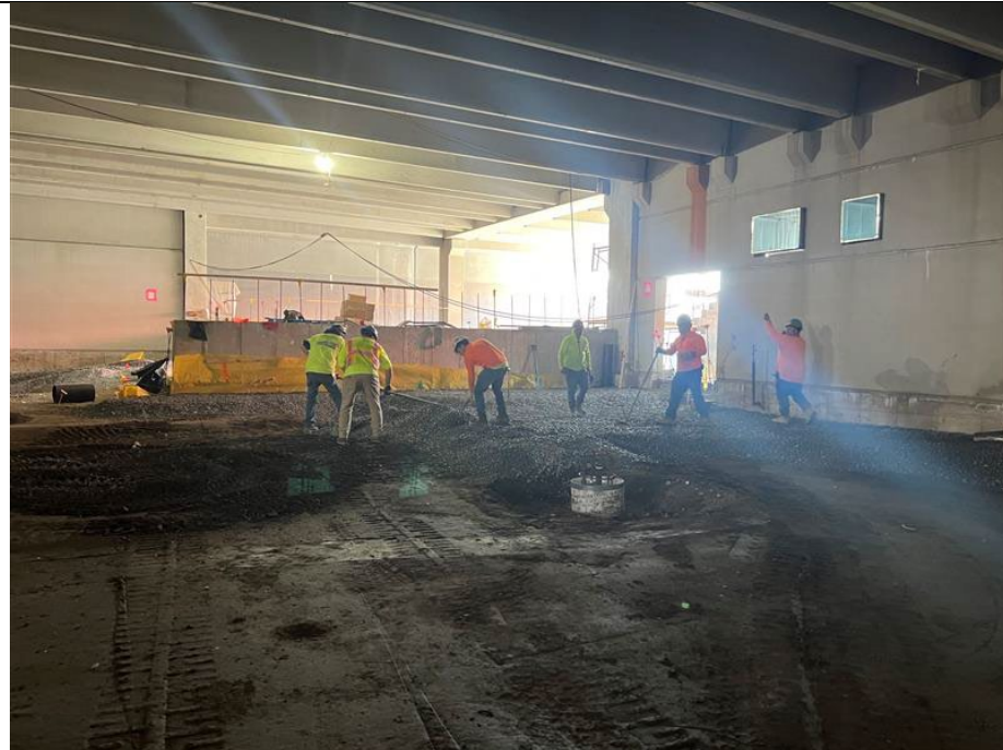
Photo 3: Looking southwest, kingdom backfilling grid B3 with ¾" stone in preparation for SSDS installation.