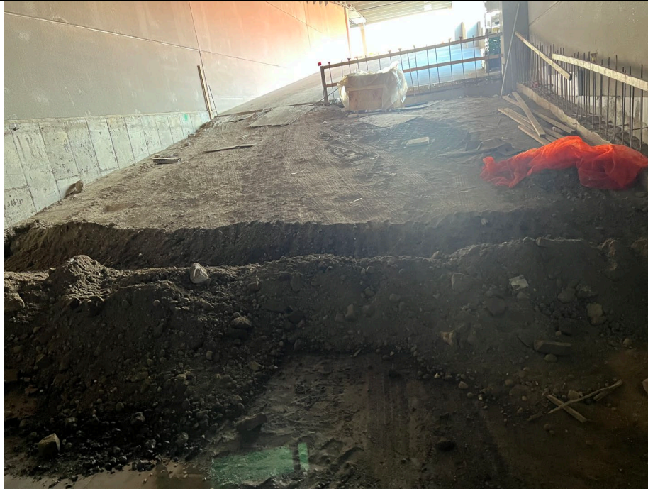
Photo 1: Looking south, status of unfinished ramp leading from first to second floor.