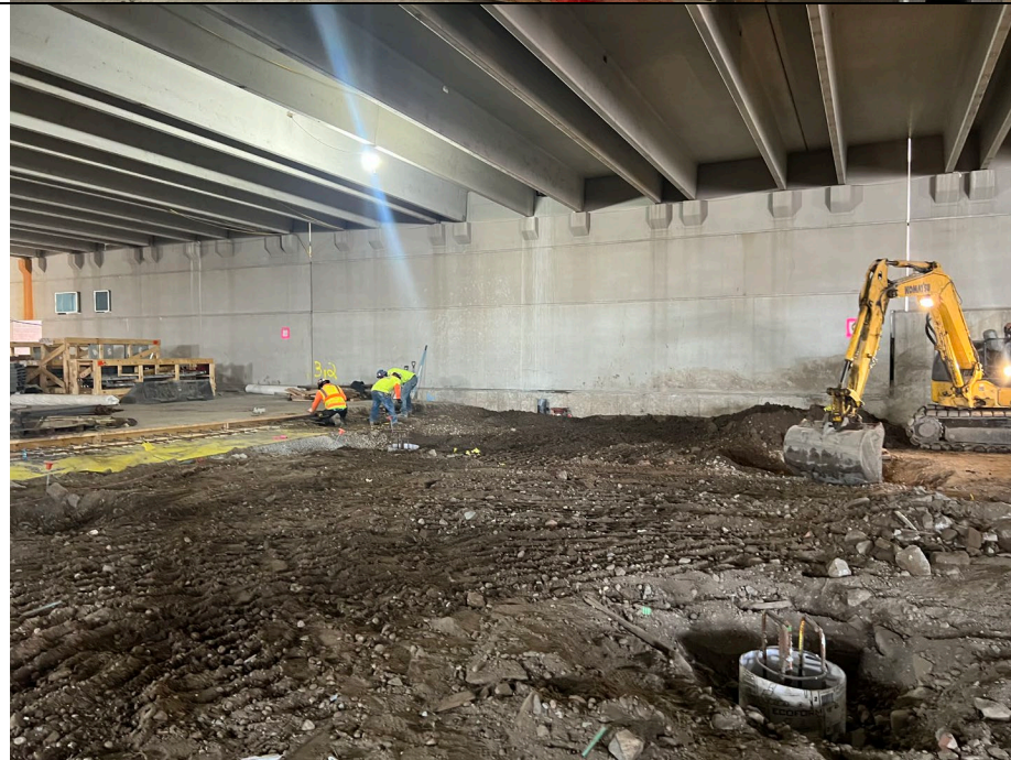
Photo 4: Looking west, Kingdom grading soil in portion of grid B2.

Submitted By: Marilyn Villacres of Roux Environmental Engineering and Geology, D.P.C.