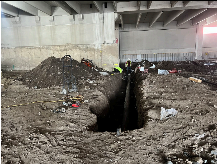
Photo 2: Looking west, progress of storm drainpipe installation in grid B1.

Submitted By: Marilyn Villacres of Roux Environmental Engineering and Geology, D.P.C.