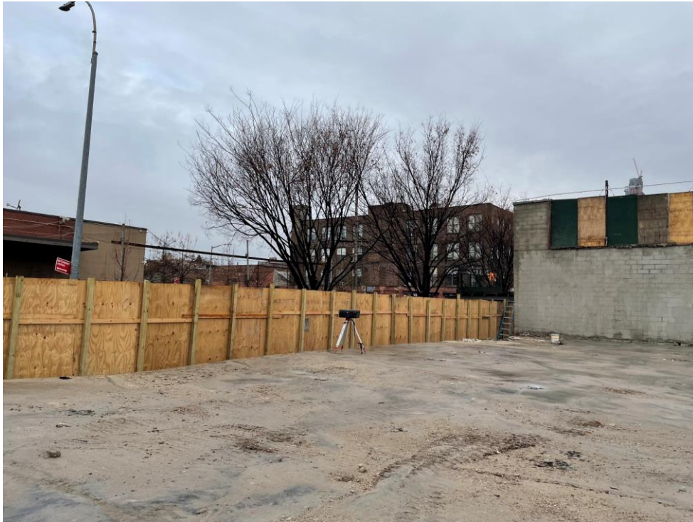
Photo 1: Air monitoring station on the western site perimeter (facing northwest)