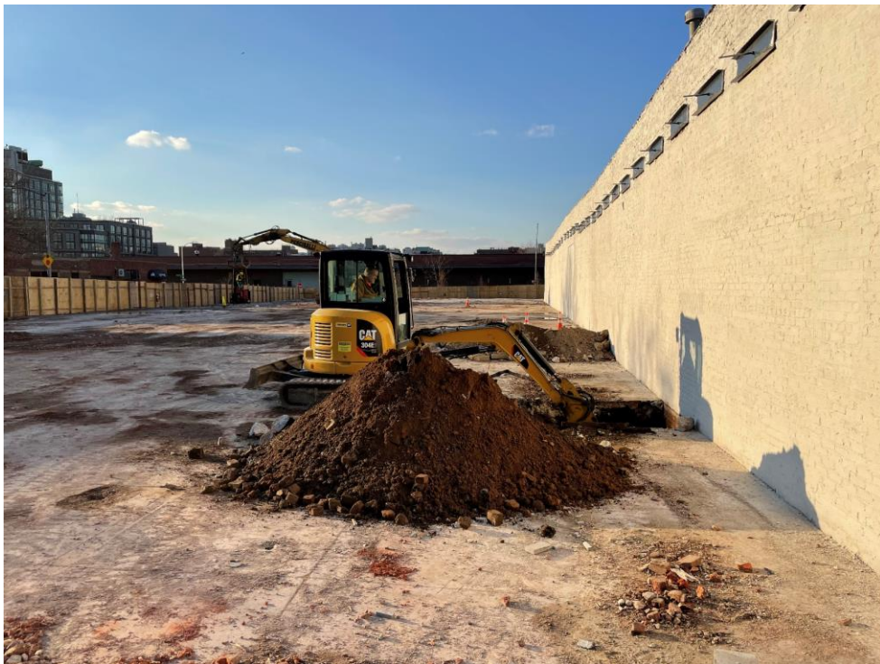
Photo 2: Perciballi Industries excavating test pit TP-3A (facing west)