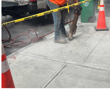
Photo showing dust from breaking concrete pre-hand clear.