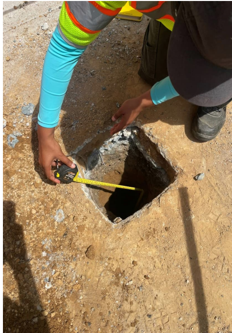
Fully excavated hole, down to 5ft bgs (first location)