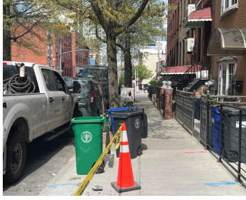
Upwind CAMP unit outside 101 S 4th St.