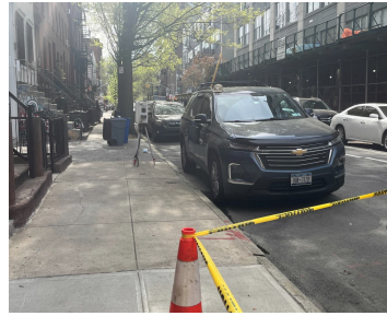
Downwind CAMP unit outside 101 S 4th St.