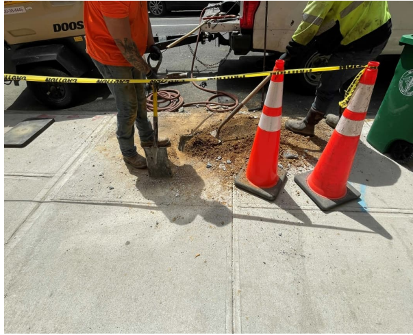
First well location set up.