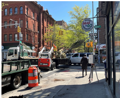
Tree planting occurring adjacent to the Upwind unit