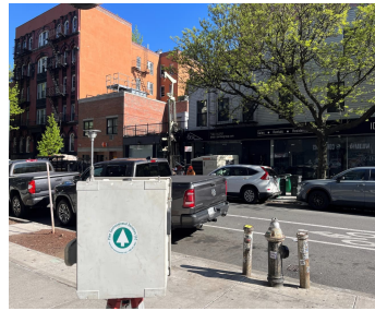
Upwind CAMP unit