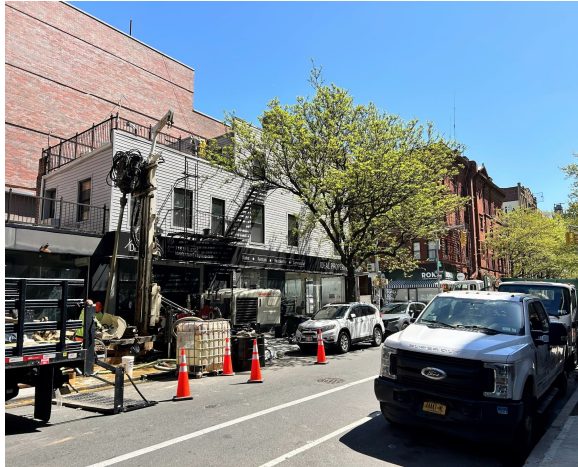
Workzone at 123 South 4th Street to drill and install MW-01