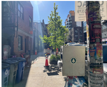
Downwind CAMP unit