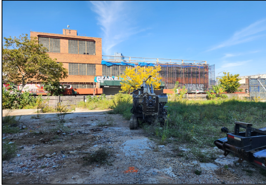
Photo 2: Soil sample collection at boring location B1804 with evidence of petroleum.