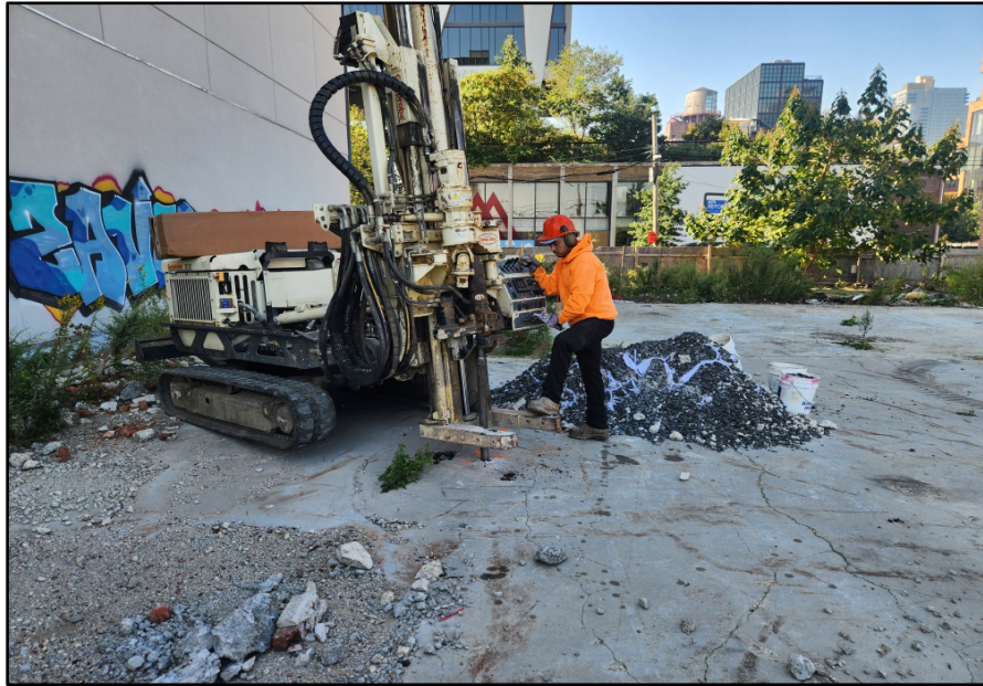
Photo 2: Soil sample collection at boring location P-2 with evidence of petroleum.