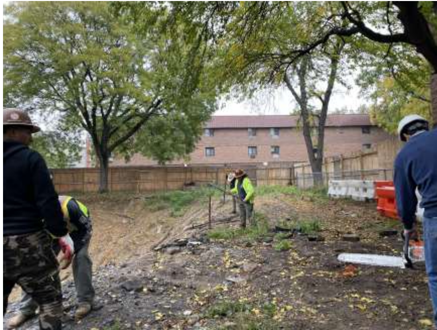
Photo 1: View of SD Builders installing a safety barrier around the existing excavated area of the site (facing north).