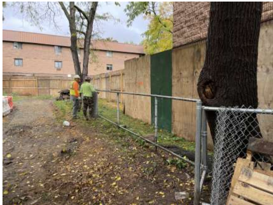
Photo 2: View of SD Builders removing chain-link fence along the eastern perimeter of the site (facing north).