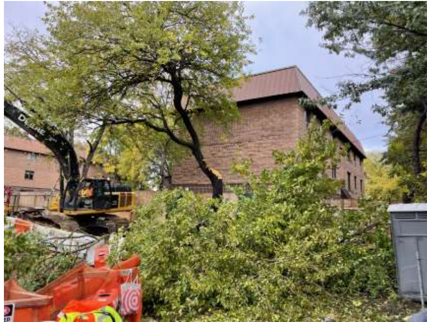
Photo 1: View of SD Builders removing trees in along the eastern perimeter of the site (facing east).