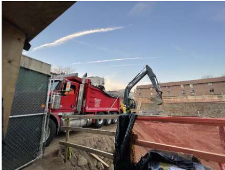
Photo 2: View of Rise securing a tarp on a permitted tri-axle truck for transport of non-hazardous fill for off-site disposal (facing northwest).