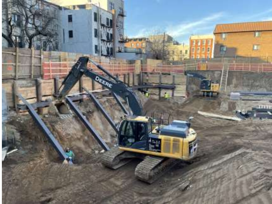
Photo 1: View of Rise excavating native soil for SOE underpinning installation in the western part of the site (facing northwest).