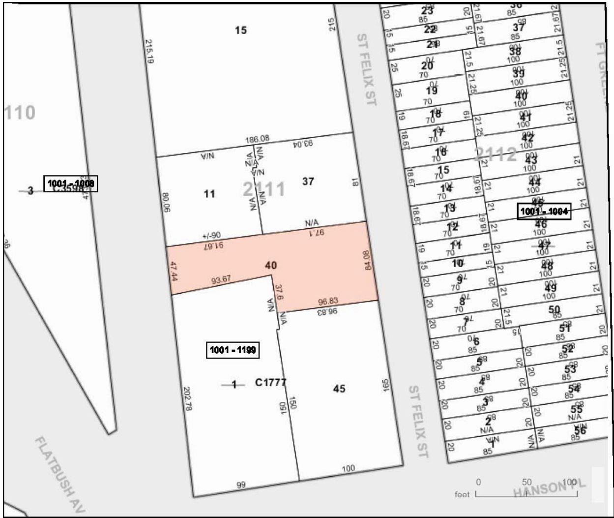
EXHIBIT A SITE MAP