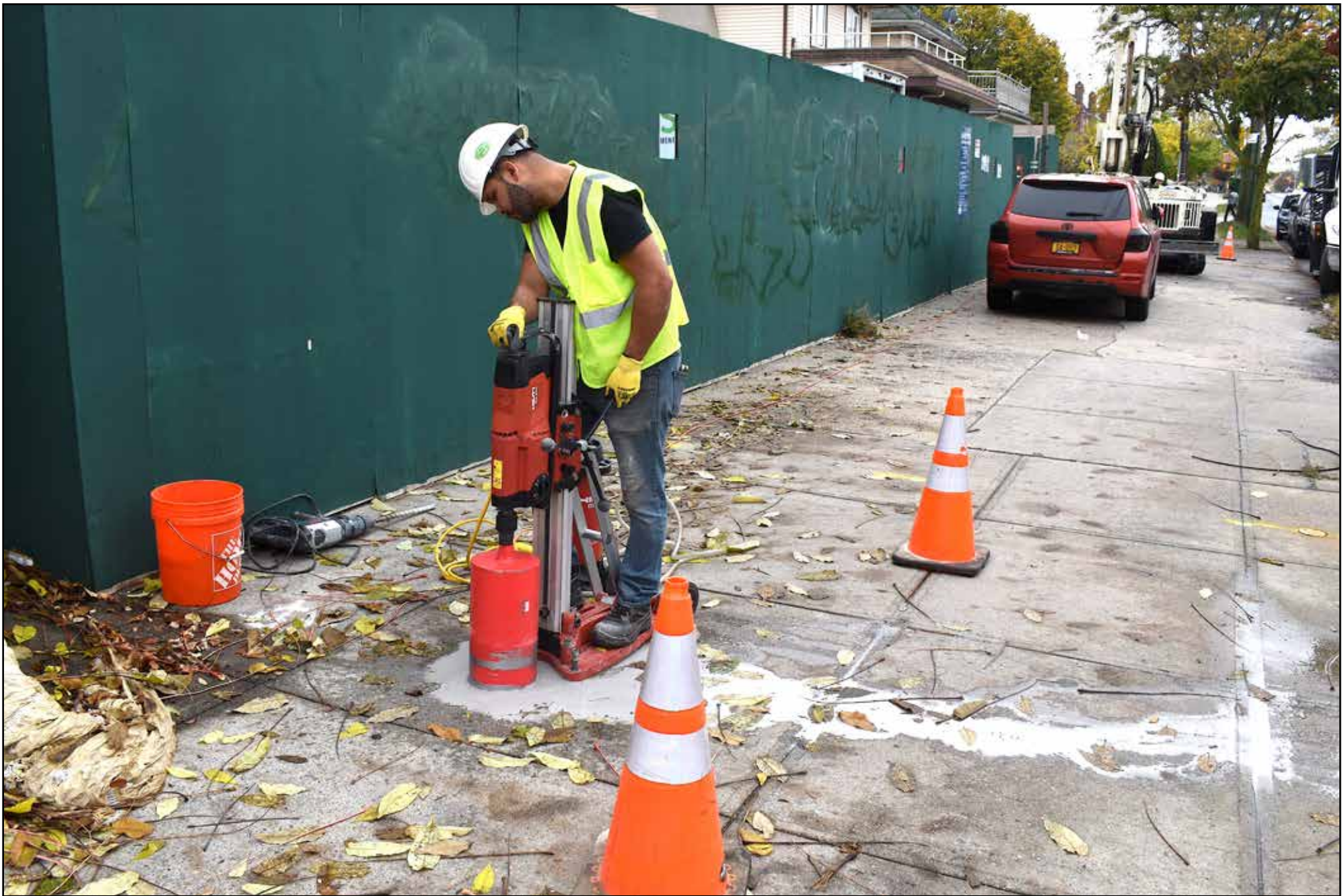
SOIL SAMPLE SBO-4 MIDDLE OF BLOCK ON STILLWELL AVENUE