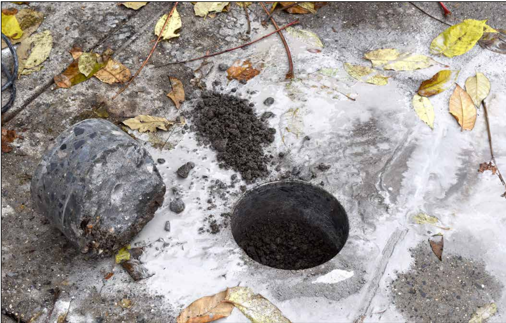
SOIL SAMPLE SBO-4 MIDDLE OF BLOCK ON STILLWELL AVENUE