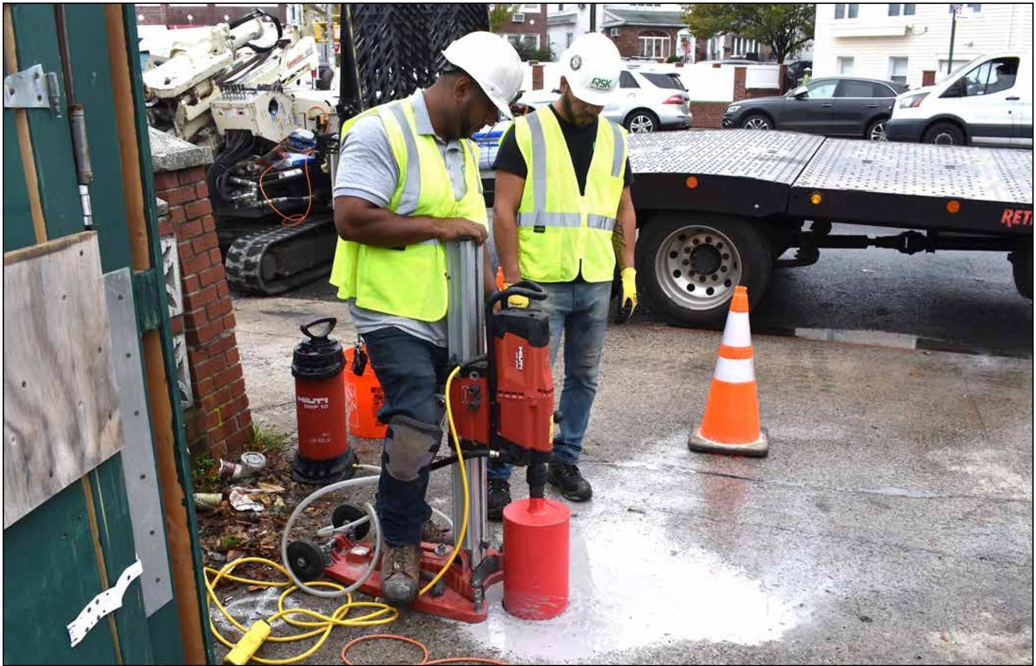
SOIL SAMPLE SBO-5 IN FRONT OF WORK-SITE ON STILLWELL AVENUE 2