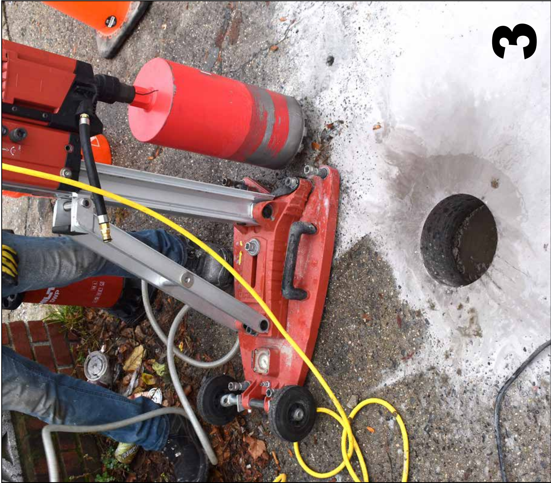
SOIL SAMPLE SBO-5 IN FRONT OF WORK-SITE ON ON STILLWELL AVENUE