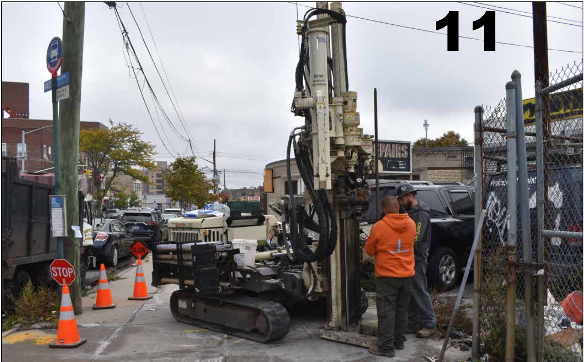
SOIL SAMPLE SBO-9 NEAR THE BUS STOP AT CORNER OF STILLWELL & KINGS HIGHWAY