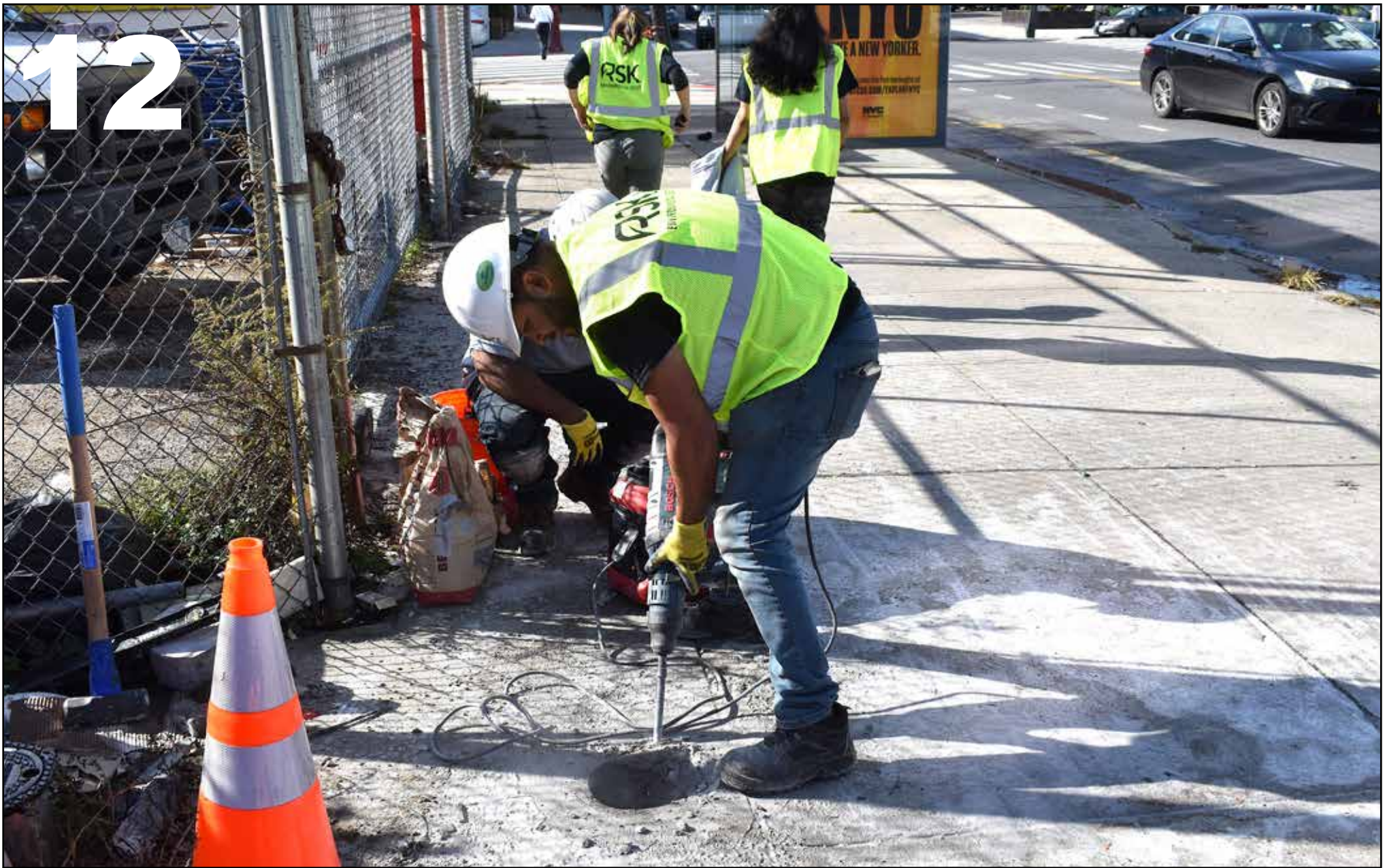
SOIL SAMPLE SBO-9 NEAR THE BUS STOP AT CORNER OF STILLWELL & KINGS HIGHWAY