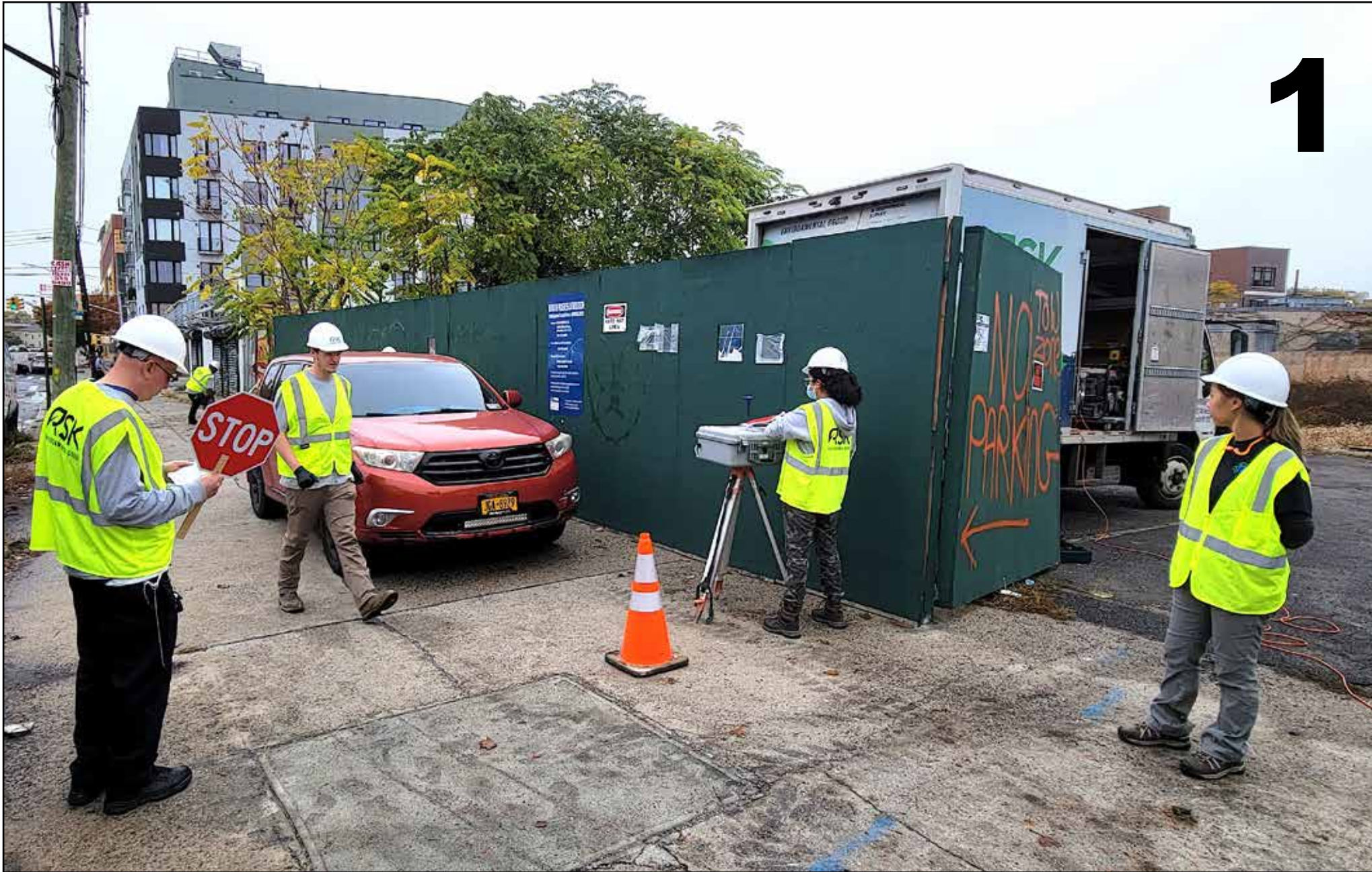
SOIL SAMPLES AT 1665 STILLWELL AVENUE BROOKLYN, NY PHOTOS TAKEN WEDS 10/26/2022