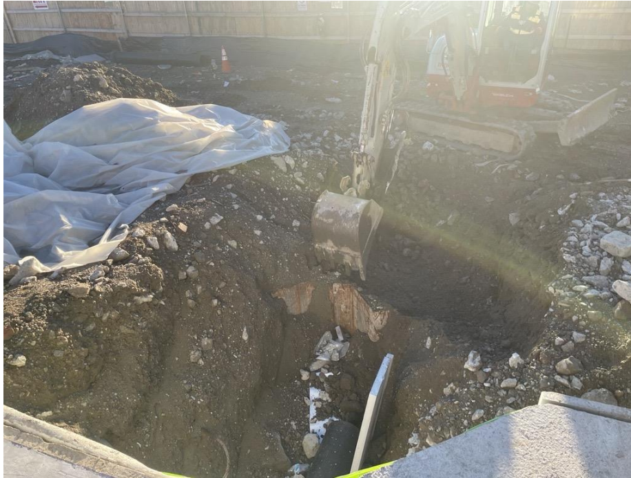
Photo 1: Bauer excavating a trench for the stormwater conduit installation in the southeastern part of the site (facing east)