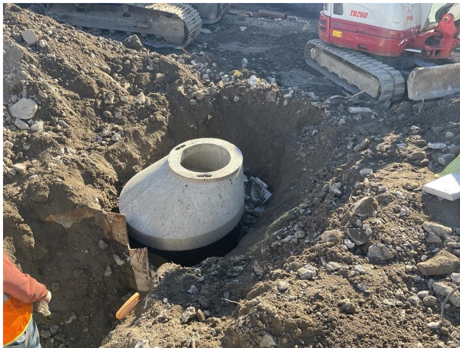
Photo 2: View of the installed manhole in the southeastern part of the site (facing east).