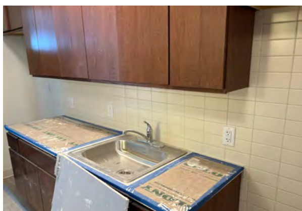
3. 8 th floor apartment kitchen