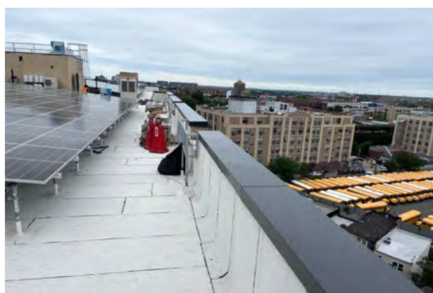
4. Roof parapet and solar panels