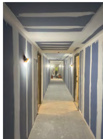
2. 8 th floor hallway-Taped