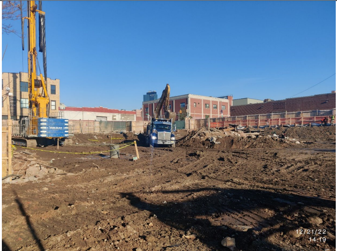
Photo 2 – Representative view of ABC pumping out 5,000-gallon UST.