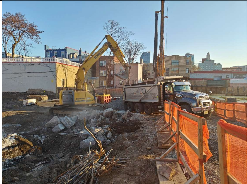
Photo 4 – Representative photo of live excavation in petroleum impacted area. IEEG spraying Atmos Foam on excavation area.