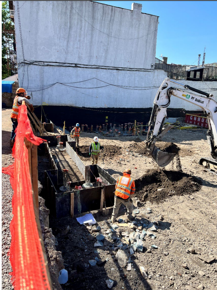
Photo 6 - Representative photo of site at end of day.