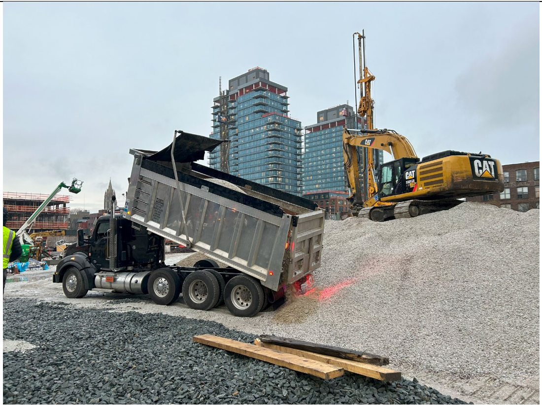
Photo 1 – Representative photo of imported material being off loaded on northern portion of the Site.