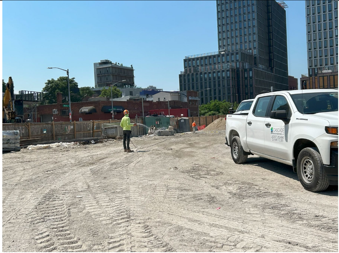
Photo 2 – Representative photo of National Grid gas line work along Nevins Street.