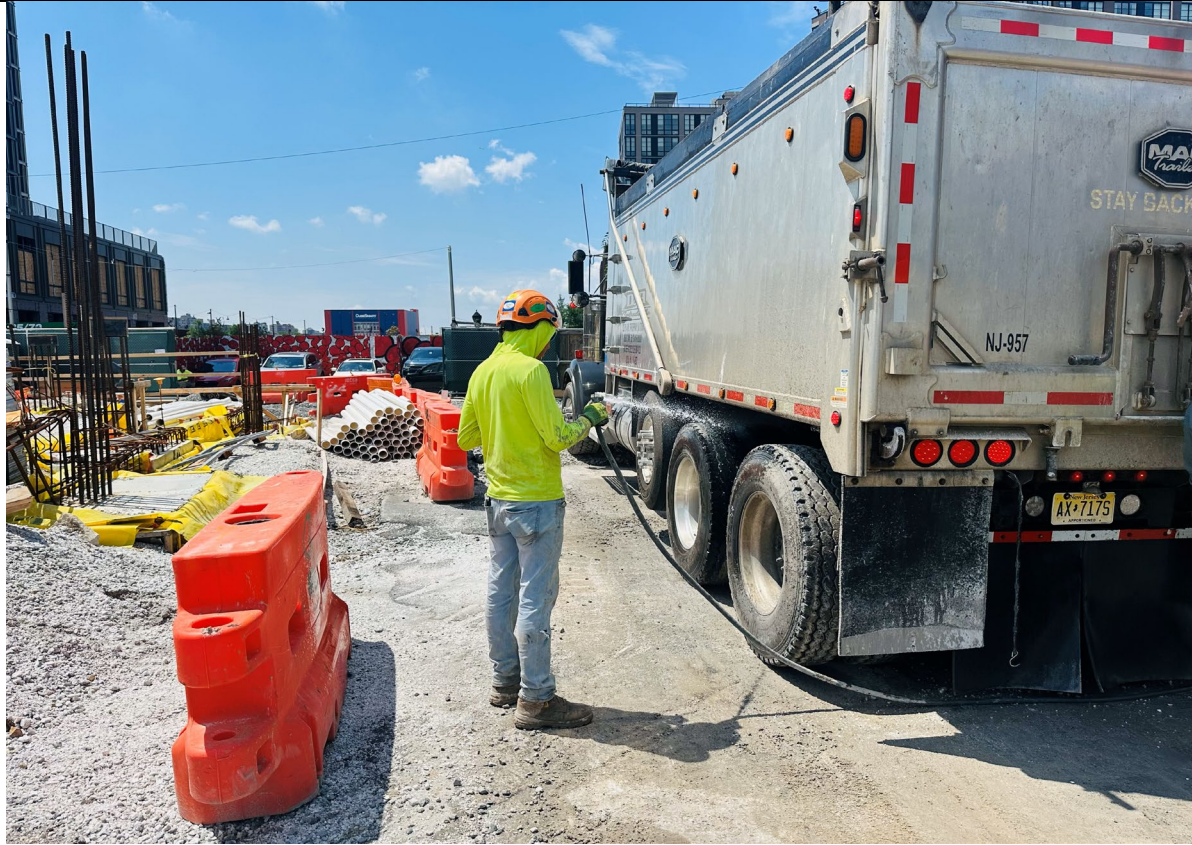
Photo 2 – Representative photo of approved crushed limestone being unloaded onto site.

Photo 1 – Representative photo of truck being washed prior to departing the Site.