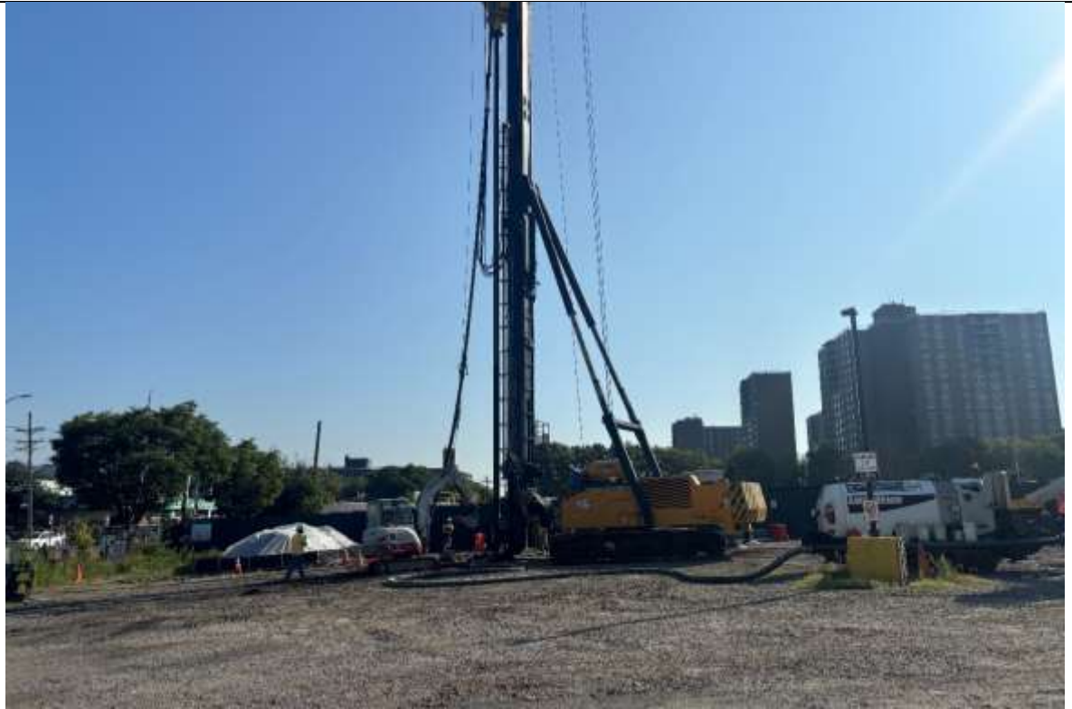
Photo 2 – Morris-Shea excavating to facilitate the removal of an obstruction in the northern portion of the Site, facing north.

Photo 1 – Morris-Shea installing foundation test piles in the northern portion of the Site, facing east.