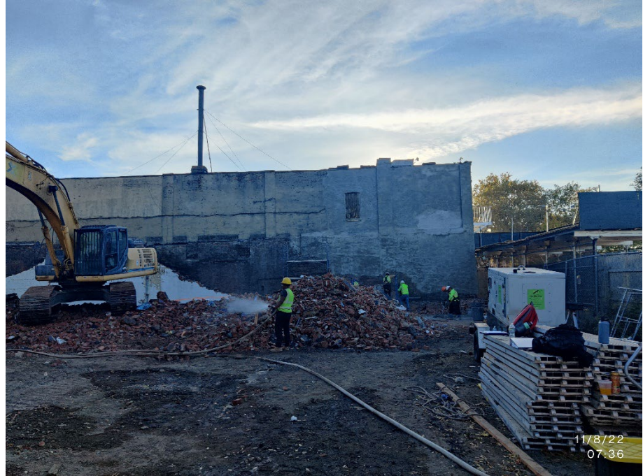
Photo 2 – Location of downwind camp unit before demolition of the 1-story warehouse building began.

Photo 1 – Representative view of the Site at the Start of the day and Xolle worker watering down brick pile being moved in order to mitigate dust.