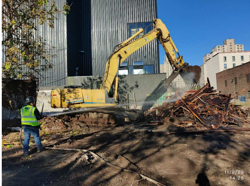
Photo 2 – Representative photo of single story warehouse structure with steel roofing beams still in place.

Photo 1 – Representative photo of excavator pulling wood from demo and placing it in the designated wood pile.