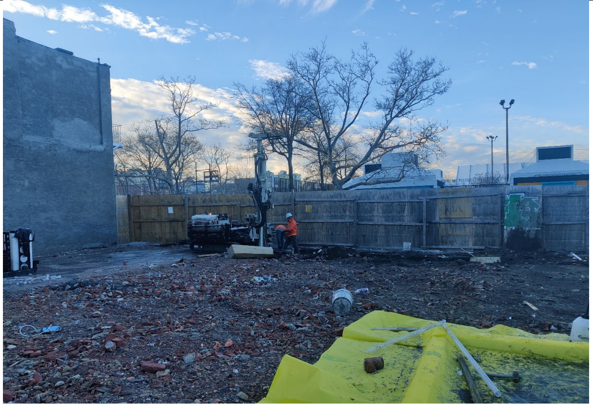
Photo 2- MGP Coal Tar identified on the outside of the liner in DB- 17, at the 30- 35' interval.