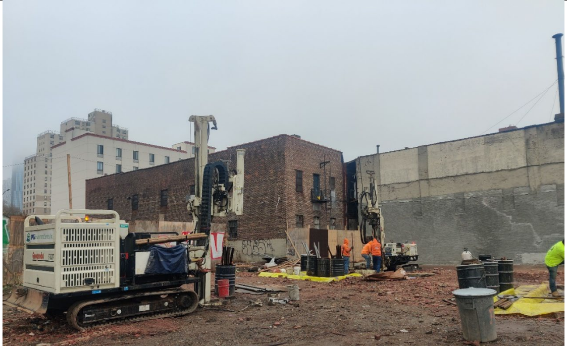
Photo 2- Representative view of boring DB-21 impacted with MGP Coal Tar at the 50-55' interval.