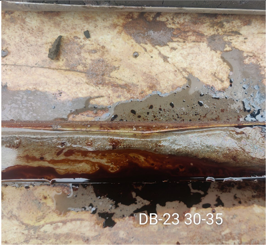
Photo 5- Representative view of the Site at the end of the days activities.