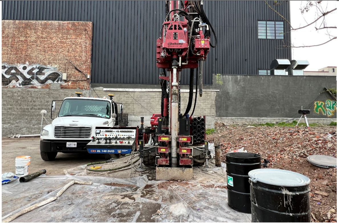
Photo 2 – Representative photo of sonic drilling activities at cluster well location CW-4.