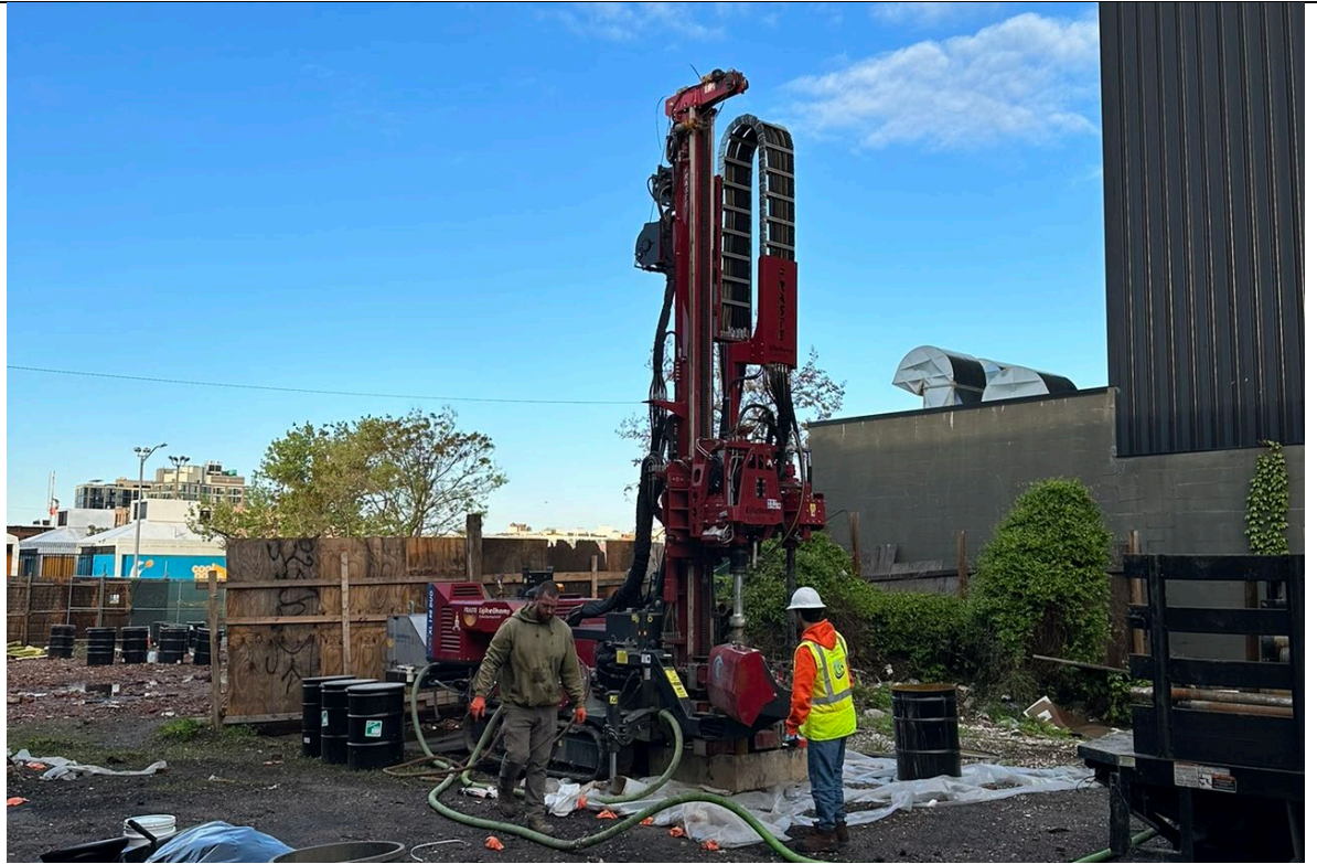
Photo 2 – Representative photo of sonic drilling activities at cluster well location CW-6-55.