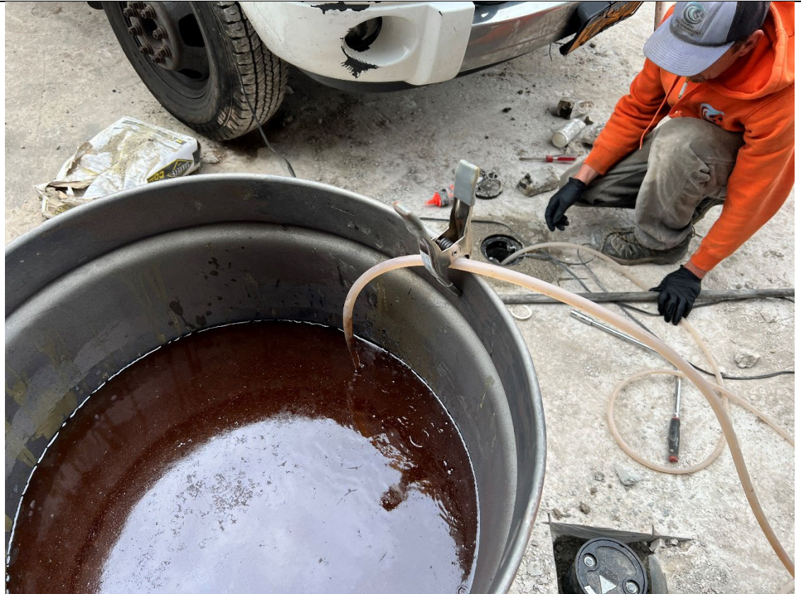
Photo 5 – Representative view of CW-4-45 during initial development. Note: MGP coal tar in tubing.