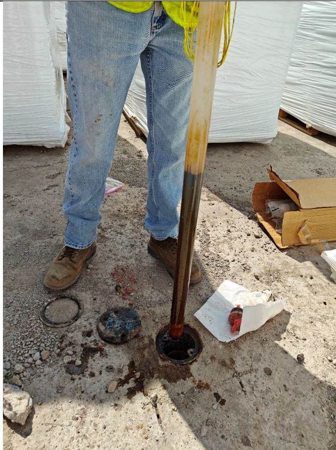
Photo 4- Representative image of NAPL from within well prior to being poured and containerized in 55-gallon steel drums.