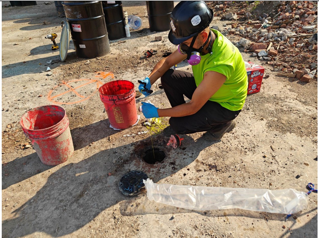
Photo 2- Additional image of bail down testing for NAPL Mobility Study.