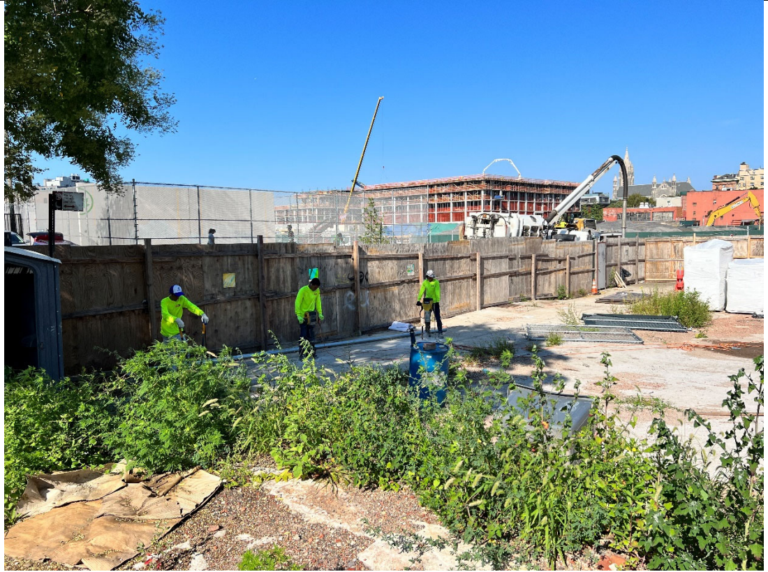
Photo 2- Representative view of fencing relocation along Douglass Street.