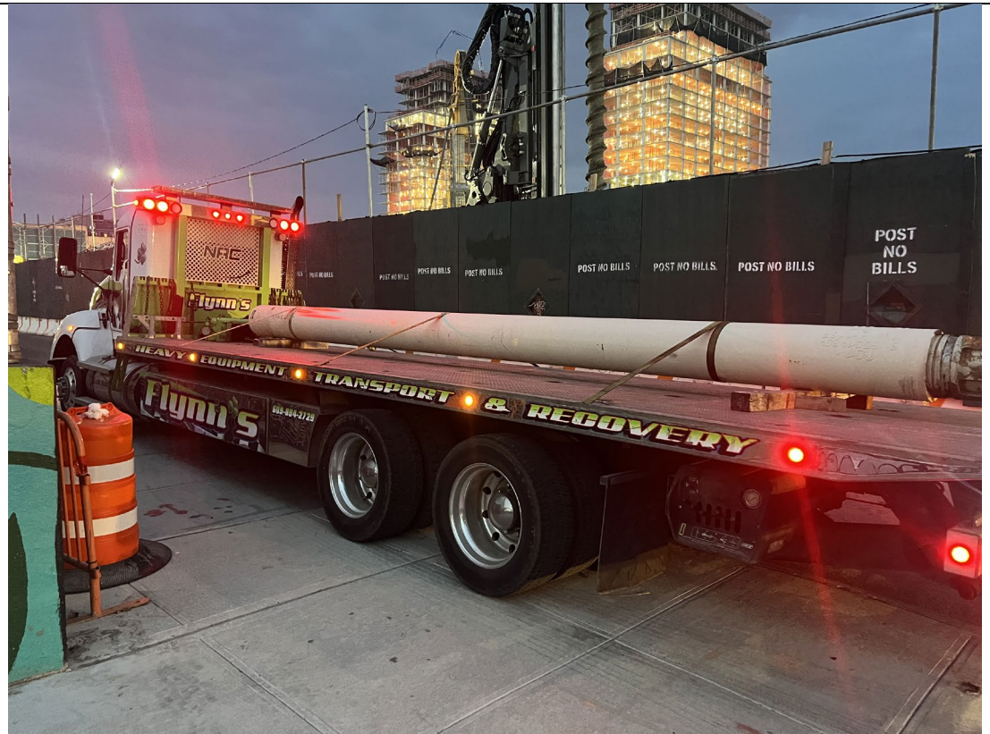
Photo 2- Representative photo of the rod and auger installed on the rig.