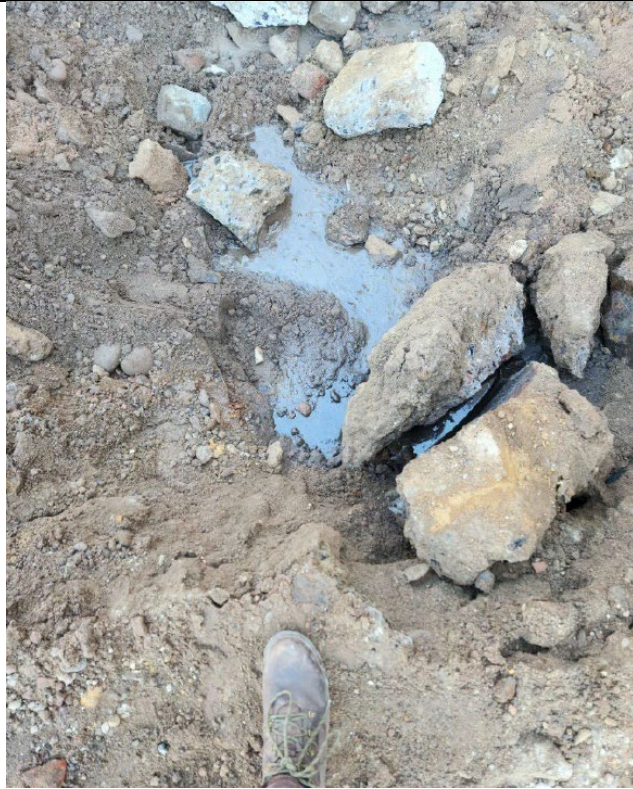
Photo 6- Representative photo of standing water in former building cellar.