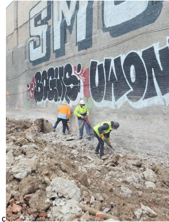
Photo 2 – Additional representative view of Xolle crew performing hand demolition along east concrete wall.