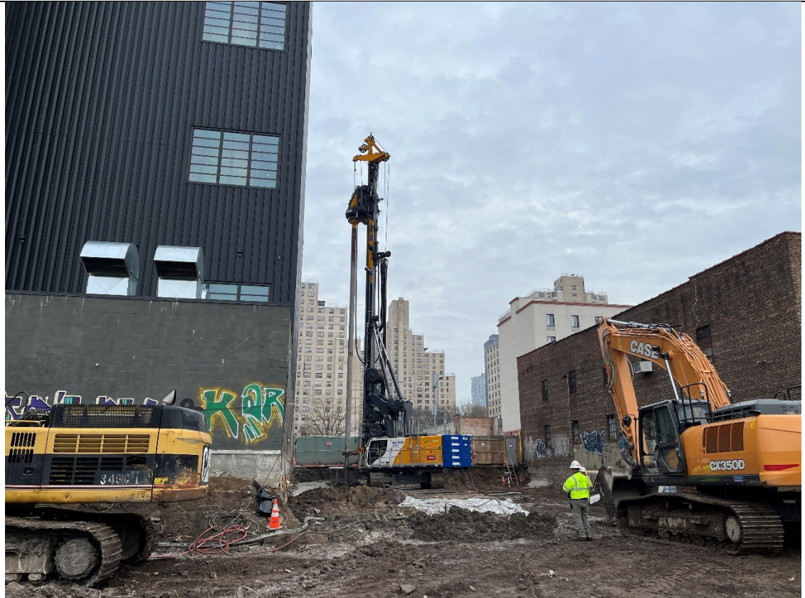
Photo 2 – Representative photo of auger cleaning after drilling activities were halted.